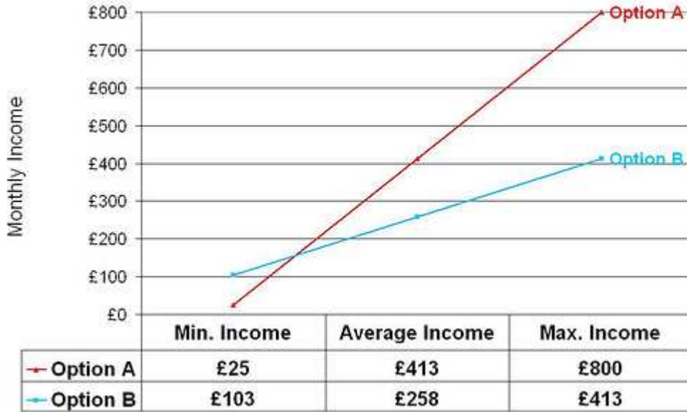
Figure 2. Graphic illustration of income distributions.

Under the assumptions of the standard model, this information can be used to estimate the coefficient of relative inequality aversion. The mathematical structure is based on Carlsson et al. (2005) and Johansson-Stenman et al. (2002), but the question-framing is different.