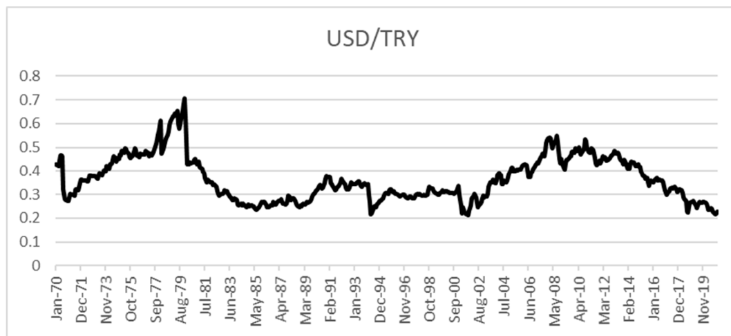
Figure 2. Real exchange rate USD/TRY.

Table 3 reports associated coefficient estimates and Table 4 diagnostic tests. In this section our analyses continue with the pass-through effects and cointegration of exchange rates and per capita income. We provide two different models for examination. First is the original ARDL model, without asymmetric effects. Next is the second model called the NARDL model, where asymmetries are included with decomposed exchange rates as partial summation.