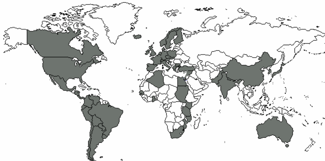
Figure A.1. Selected countries.

Algeria Argentina Australia Austria Belgium-Luxembourg Bolivia Brazil Bulgaria Canada Chile China Colombia Costa Rica Croatia Cyprus Czech Republic Denmark Dominican Republic Ecuador Egypt, Arab Rep. El Salvador Finland France Germany Ghana Greece Honduras Hong Kong, China Iceland