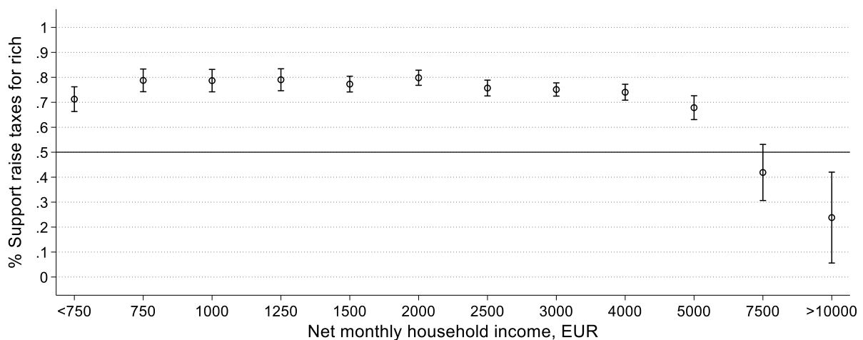
Figure 1: Support for taxing the rich more in Germany by income (2021)

Note: Online-Survey (N=5,550) fielded in December 2021; predicted probabilities to support a lot/somewhat higher taxes for the rich with 95% confidence intervals based on logistic regression. Models include controls randomly varied question wording (see Appendix A).