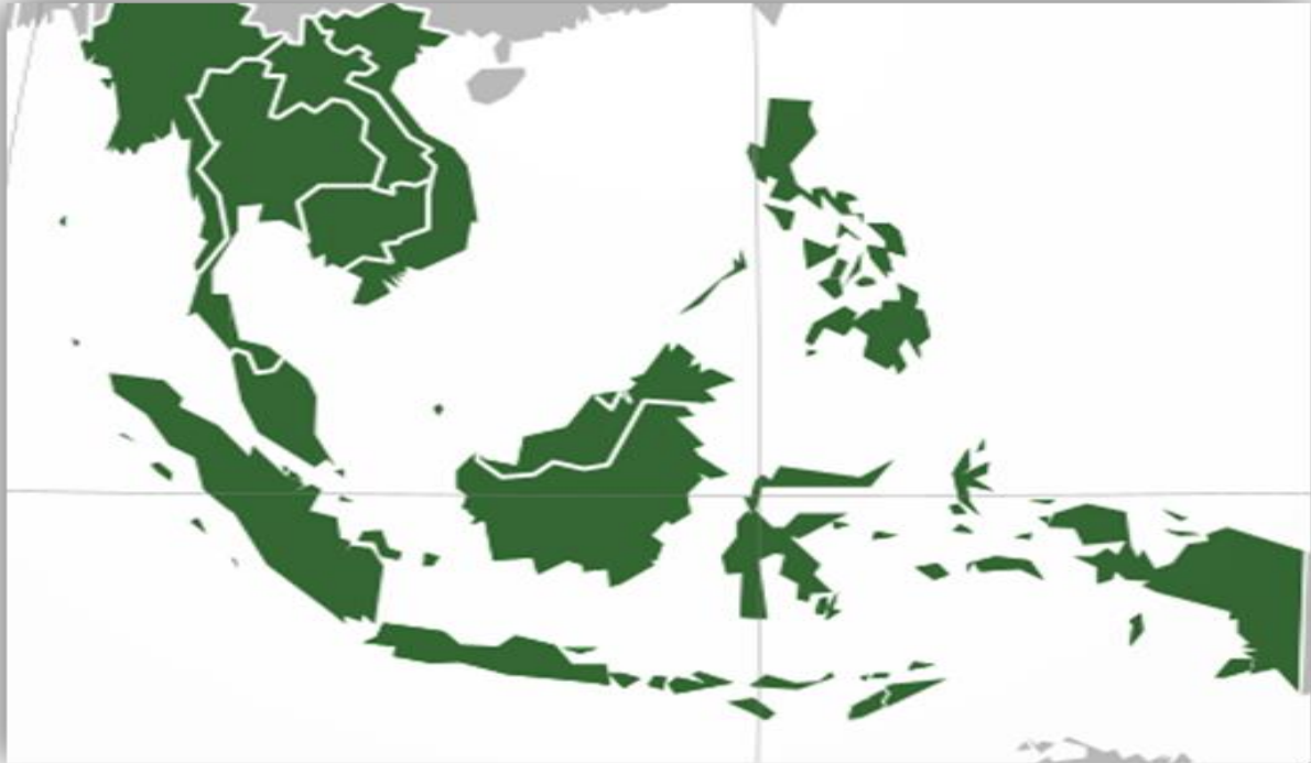
Figure 3. Research Location.

of this study since Malaysia, Philippines, Singapore, Thailand, Indonesia, and Vietnam (Figure 3) are extremely favourable markets for the quick expansion of LST and offer tremendous business opportunities due to these countries' high rates of internet, mobile, and e-commerce penetration [102]. An increasing percentage of consumers from Malaysia, Philippines, Singapore, Thailand, Indonesia, and Vietnam are using LST; these countries have started to embrace the booming LST sphere [103].