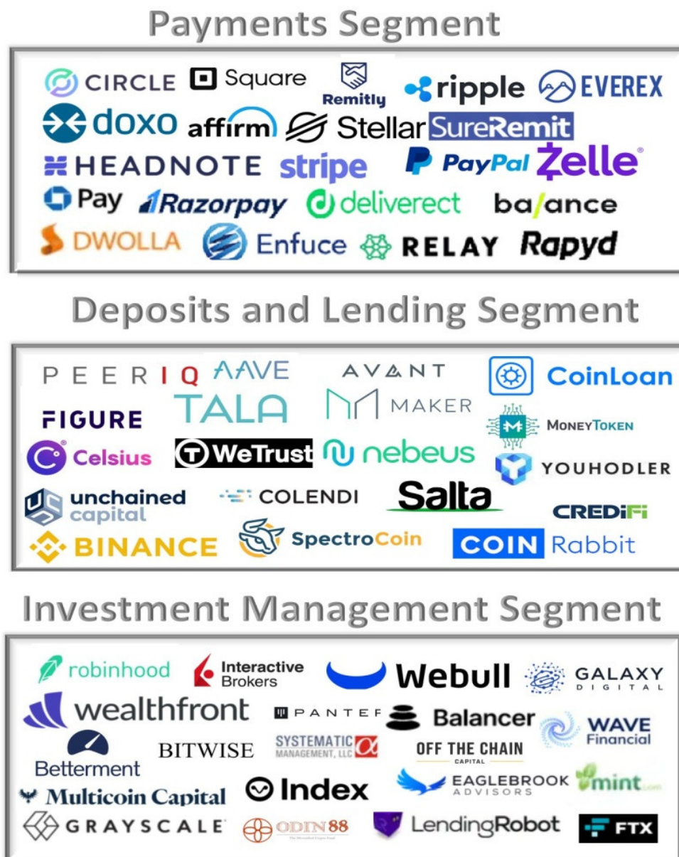
Figure 2. FinTech companies and segments.

Figure 2 shows a sample of the current FinTech companies within their assigned FinTech Segment.