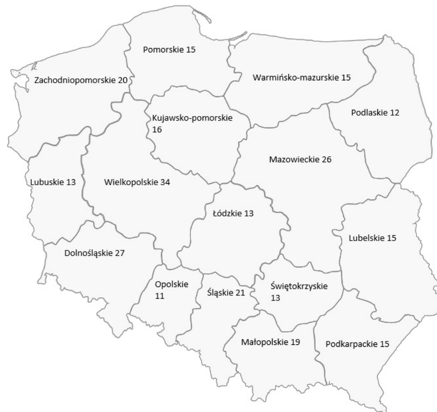
Figure 1. The amount of researched cities in Polish provinces.

As a result of the research, 287 correctly completed questionnaires were received. The distribution of the sample by individual provinces was as follows: Dolnośląskie—27; Kujawsko-Pomorskie—16; Lubelskie—15; Lubuskie—13; Łódzkie—13; Małopolskie—19; Mazowieckie—26; Opolskie—11; Podkarpackie—15; Podlaskie—12; Pomorskie—15; Śląskie—21; Świętokrzyskie—13; Warmińsko-Mazurskie—15; Wielkopolskie—34; Zachodniopomorskie—20. We put the amount of researched cities from each of the Polish provinces on the map of Poland in Figure 1.