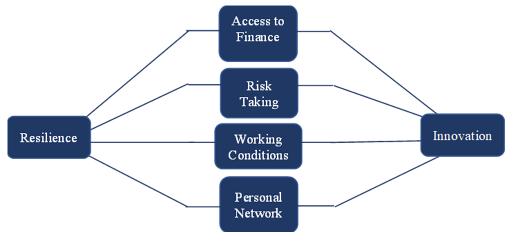
Figure 1. Conceptual model.

Concerning the theoretical concepts discussed above as well as the hypotheses presented in this chapter, the following conceptual framework was developed to analyze the subject in more detail (Figure 1).