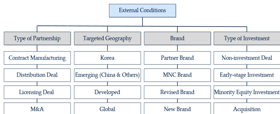
Figure 2. Research framework: external conditions for partnership.

Therefore, the following criteria for the external conditions are obtained: type of partnership, targeted geography, brand, and type of investment (Figure 2).