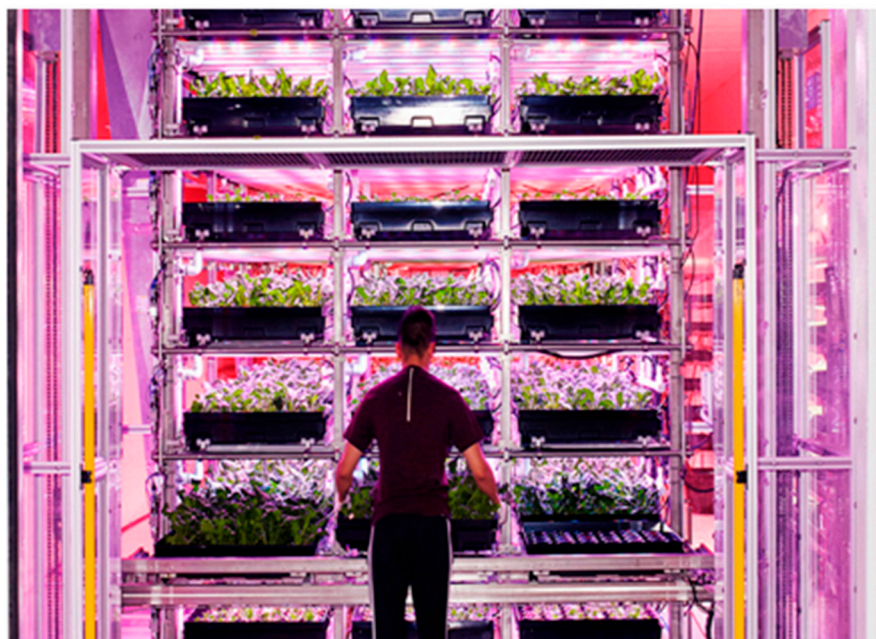
Figure 5. We the Roots vertical farm in Toronto. The farm is located inside an adaptively reused Second World War warehouse in the city centre.

Finally, it is worth bearing in mind that, while vertical farms have been planned, as shown in Figure 6, they are outweighed, unsurprisingly, by low rise and even rooftop gardens. The oversold idea of Toronto's ambitious Skyfarm 58-storey Agritower designed by architect Gordon Graff remains at proposal-only stage, as indeed do most registered in the first decades of this century. Figure 6 updates Pyramid Farm guru Dickson Despommier's now dated effort which, nevertheless, includes then actually existing vertical farms [15]. These include: South Korea's three-storey 'grow lights' facility; Japan's Kyoto 50+ Nuvege peri-domestic 'half-lights/half-sunlight' units; Singapore's Sky Greens four-storey sunlight-fuelled facility; Chicago's The Plant three-storey 'grow lights' plant; Chicago's FarmedHere 'grow lights' unit; and Vancouver's four-storey Alterrus 'sunlight' building (bankrupted in 2014). Some of the above are shown in Figure 6.