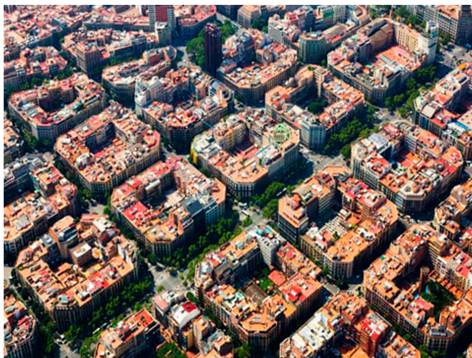
Figure 10. Nine street blocks in Barcelona's Eixample quarter will make up a 'superblock' in the city's new green strategy.

Another architect advocating for the conservation of heritage cityscapes and abandoned villages by repurposing empty buildings is Stefano Boeri, who, in contrast to