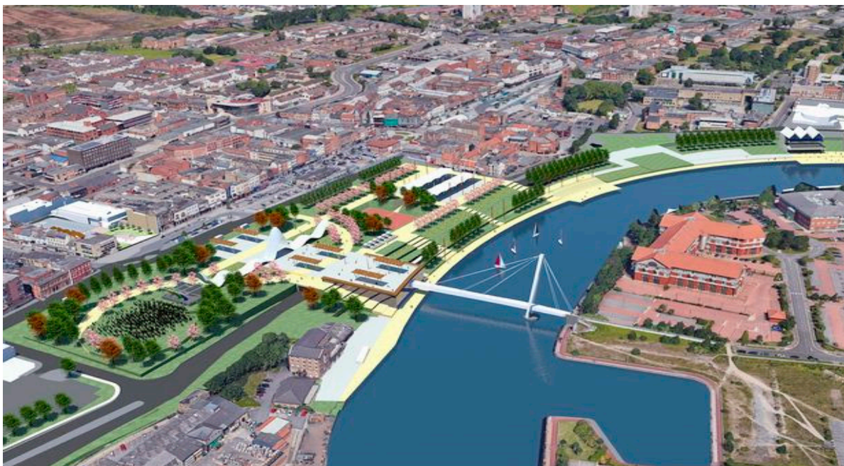
Figure 8. Proposed plan for Riverside Park, Stockton-on-Tees, UK.