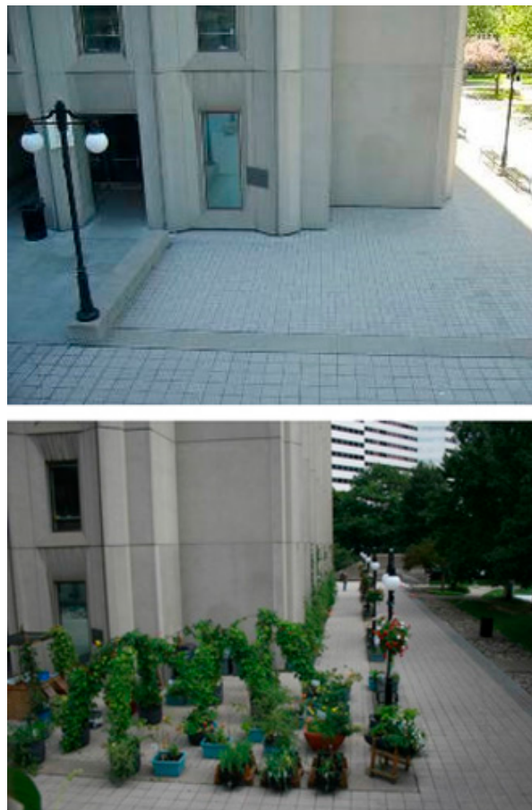
Figure 4. McGill University School of Architecture's Edible Campus Before and After Cultivation.