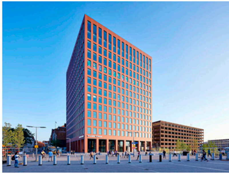
Figure 7. Thames Tower Reading, purchased by Spelthorne council as part of a £285 million deal in August 2018.