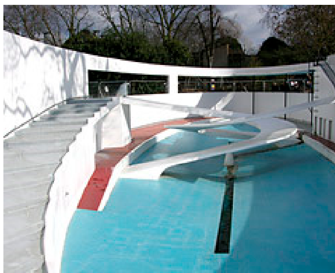
Figure 9. The Lubetkin Penguin Pool at London Zoo. (Source: Tecton).

consulting engineer to other leading modernists such as Wells Coates, Maxwell Fry and Erno Goldfinger.