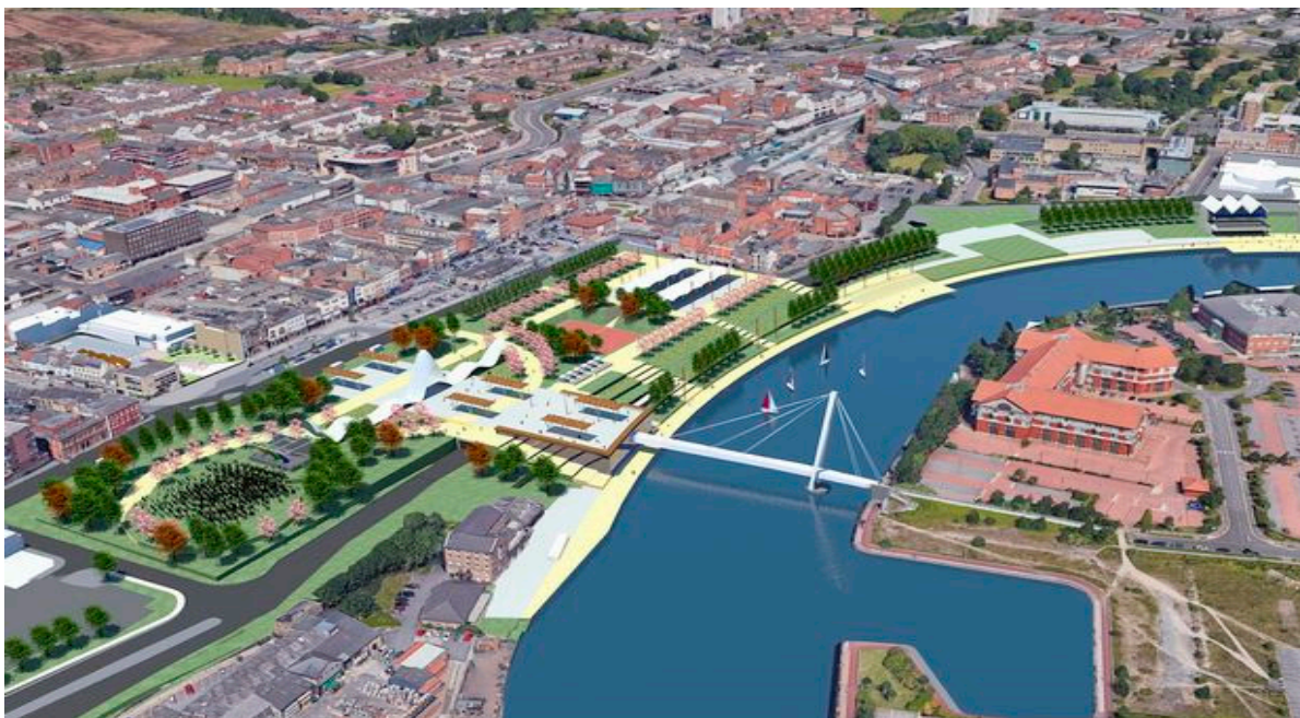
Figure 8. Proposed plan for Riverside Park, Stockton-on-Tees, UK.