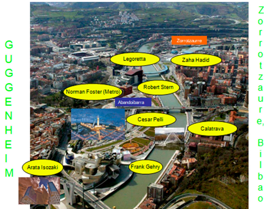
Figure 1. Bilbao’s portfolio of starchitect projects.

labelled as ‘paper architects’, whose designs were also often unbuilt and unbuildable. Moreover, the late Ricardo Legoretta, from Mexico, whose style was influenced by the Basque master sculptor and architect Eduardo Chillida, completed his Melia Bilbao Hotel nearby in 2005.