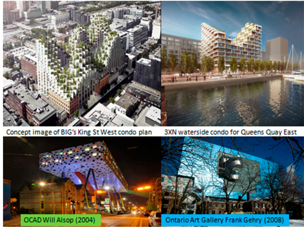
Figure 2. Projected (Top) and Existing Starchitecture in Toronto.

and 3XN compared to the preceding more Cuboid and subsequent swirling forms Zaha Hadid era. However, perhaps the ‘apotheosis of angular’ is expressed in the celebrated internationally renowned ‘Deconstructivist’ architect Daniel Libeskind, after whom another art gallery and museum extension, the Royal Ontario Museum (ROM), was opened in 2007 (Figure 3).