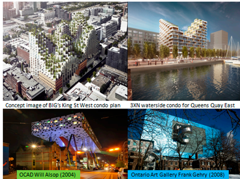
Figure 2. Projected (Top) and Existing Starchitecture in Toronto.

and 3XN compared to the preceding more Cuboid and subsequent swirling forms Zaha Hadid era. However, perhaps the ‘apotheosis of angular’ is expressed in the celebrated internationally renowned ‘Deconstructivist’ architect Daniel Libeskind, after whom another art gallery and museum extension, the Royal Ontario Museum (ROM), was opened in 2007 (Figure 3).