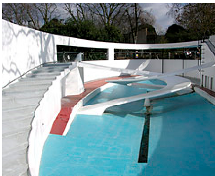
Figure 9. The Lubetkin Penguin Pool at London Zoo. (Source: Tecton).

consulting engineer to other leading modernists such as Wells Coates, Maxwell Fry and Erno Goldfinger.