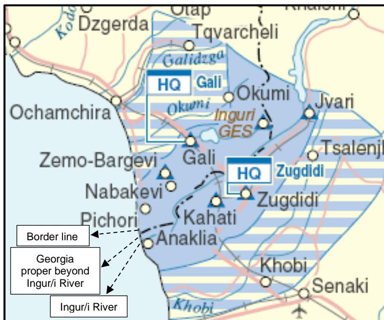
Figure 2: The border line in the lower Gal/i district

Note: author’s notes added based on a review of the author’s interview materials.