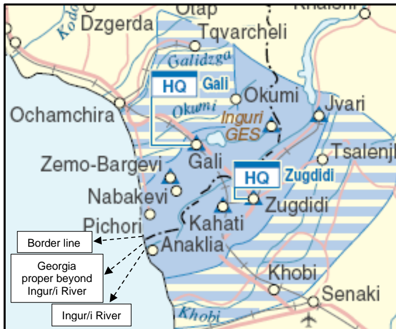
Figure 2: The border line in the lower Gal/i district

Note: author's notes added based on a review of the author's interview materials.