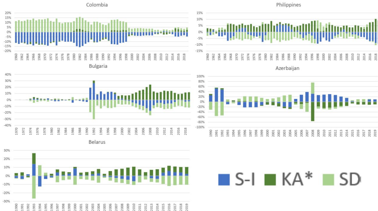
Figure A1: Countries in Table A1 with Large SD

Figure A1 shows (S - I) , KA^* , and SD , for the five outlier countries in table A1. For all five, it is clear that the very large SD values cause the estimated coefficients in table A1 to deviate substantially from one. We conjecture that in these cases this reflects significant measurement problems.