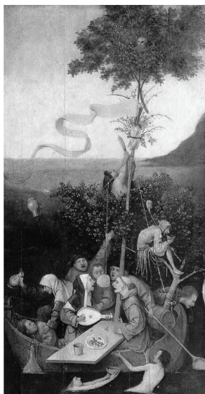
Fig. 1. Hieronymus Bosch, Ship of Fools (1490–1500)