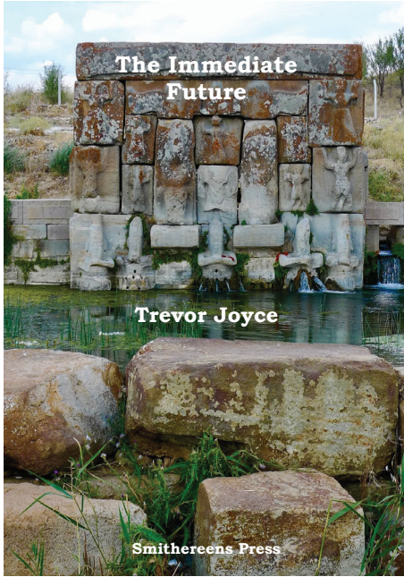
Fig. 5. Late Bronze Age ghost estate Eflatun Pinar on the cover of The Immediate Future (2017). See http://smithereenspress.com/publications/sp20.html . Cover photograph © Trevor Joyce.

indicate the onset of senescence.” 5 Senescence of a country? Senescence of a culture? Senescence of capital? Brenner dates the long downturn to this same period. I would suggest that the climacteric in these lines which destroys and yet is part of history is caused by a particular profession, as the poem tells us it “must be / professionally / provoked,” and in the context of the whole chapbook that profession is probably actuary —“actuarial circles” are mentioned in the thirty-first poem.