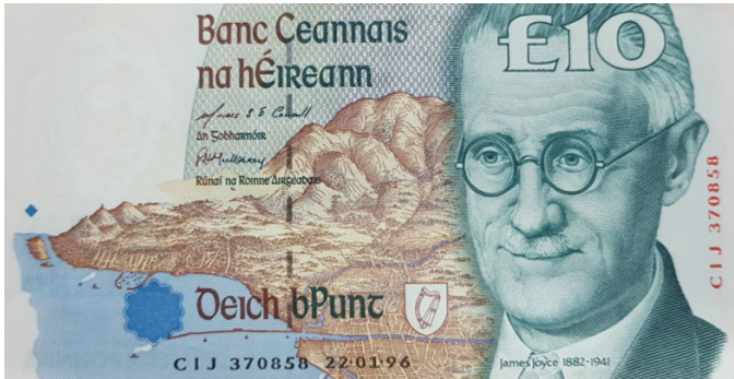
Fig. 2. C Series, €10 banknote featuring James Joyce.

financial crisis on Anglophone literature is more visibly discernible in contemporary Irish literature.