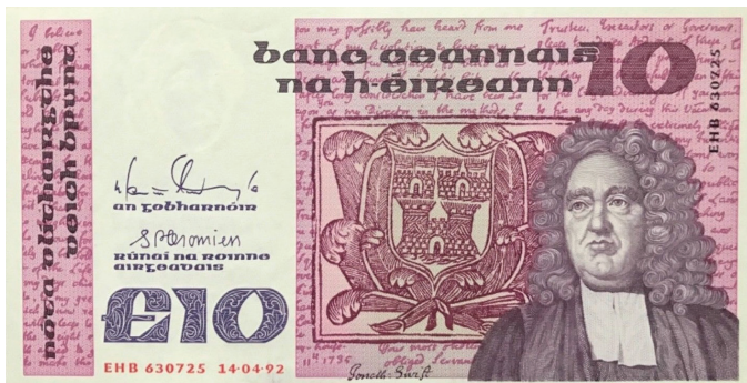
Fig. 1. B Series, €10 banknote featuring Jonathan Swift.