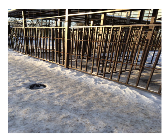
FIGURE 9. Reception facility at an FMS Office in Moscow's Bibirevo district. January 2014.

pointed to one Uzbek man standing near the reception area, assuring them that he could fix everything. The three migrants then approached the Uzbek intermediary, asking him if he could help them with their documents. The Uzbek intermediary explained, "If you give me 35,000 rubles (US$560), I will create a clean work permit for you. I always work halol (honestly), and people who get their documents through me experience no legal problems. As I said, I always work halol." Afterward, he gave the migrants his phone number and instructed them to call him after 6 p.m. Interestingly, this Uzbek man was not an official employee of FMS but rather a posrednik (intermediary) whose main function was to act as a bridge between migrants and FMS officials by facilitating the informal transactions between the two parties. From my observations I concluded that the FMS employee never directly accepted the bribe; instead, they use the posrednik's services to keep themselves free of reproach from corruption charges. That is, the FMS employees used well-organized, institutionalized, and well-established informal practices to accept bribes. Migrants were familiar with this practice and, therefore, primarily used this informal system to obtain work permits.