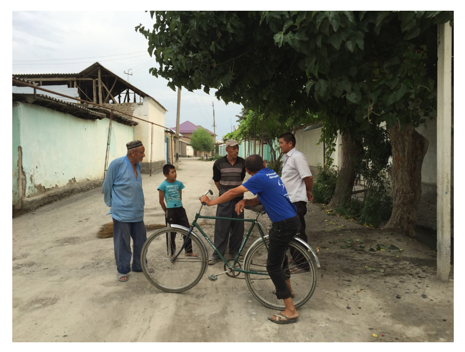
FIGURE 1. Everyday life in Shabboda village, rural Fergana, Uzbekistan. June 2016.

migrants to reenter Russia. I was truly intrigued by these daily conversations and became interested in learning more about the informal strategies adopted by entrybanned migrants. I wondered whether it was indeed possible for entry-banned migrants to reenter Russia and, if so, how that process works, what informal strategies and tactics are employed to navigate around the entry-ban system, and the implications of these strategies and processes for understanding the functioning of the Russian migration regime.