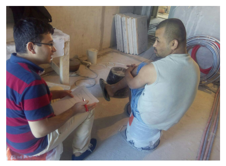
FIGURE 2. The author interviews an Uzbek migrant worker at a construction site in Moscow province. July 2015.

operating system (or iOS), thanks to remittances sent from Moscow. During my fieldwork I regularly visited migrants' left-behind families and carried out observations and informal interviews at the village "gossip hotspots" such as the guzar (community socializing space), choyxona (teahouse), gaps (regular get-togethers), and life-cycle events (e.g., weddings and funerals) where many villagers, including women, children, and religious leaders, came together on a daily basis and conducted the bulk of the village's information exchanges. Because I met more than ten villagers on a daily basis during various social events, situations, and spaces, it is difficult to pinpoint the exact number of individuals with whom I chatted during these site visits. Instead, the narrative I provide in the subsequent chapters can be understood as a composite of the voices of the hundreds of villagers I encountered during daily visits to the guzar , choyxona , gaps , wedding feasts, circumcision ceremonies, and funerals.