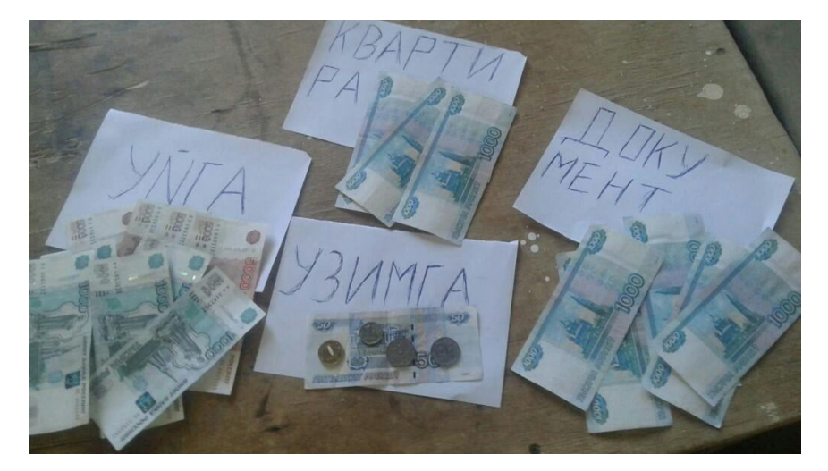
FIGURE 4. A migrant's monthly income is divided into four different expenses: sending money home (уйга), accommodation (квартира), monthly work-permit fee (документ), and meals and daily transportation (узимга) expenses. As a result, this migrant has only 71 rubles (US$1) left for his monthly meals and transportation expenses. August 2016.

an authentic patent and work legally. But, after a few months and owing to the expensive monthly patent fee or delays in salary payment, migrants begin buying fake patent payment receipts from intermediaries at the Kazansky railway station. When stopped by police officers, migrants typically present these fake receipts. This strategy often works since police officers do not have the capacity to check the authenticity of various receipts. To discover whether receipts are authentic, police officers must send them to the tax department, a process that might take several days. Not wanting to engage in bureaucratic hassles, police officers usually let migrants go and, instead, target those "completely paperless" migrants not well-connected to Kazansky intermediaries. These examples indicate that the Russian policies of migration control have produced additional undocumented migrants for the shadow economy rather than simplifying the procedures for legalizing the foreign labor force.