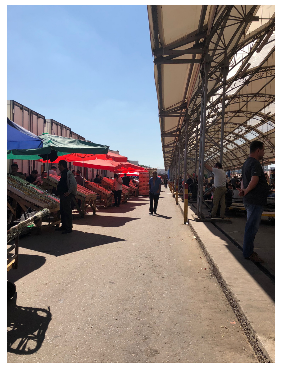
FIGURE 7. Everyday life in Food City, Moscow: Shadow Economy Hotspot. August 2018.

many Tajik protection racketeers at construction sites and bazaars. In addition, some cases exist whereby a Tajik diaspora leader regularly recruits Chechen protection racketeers to settle salary-recovery disputes.<sup>3</sup> One important explanation