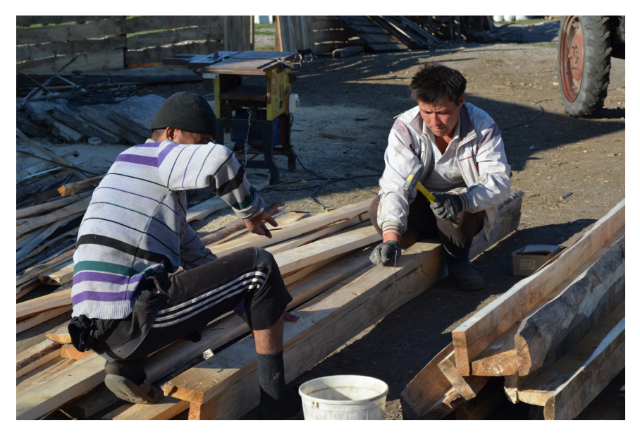
FIGURE 3. Uzbek construction workers in Moscow, Russia. September 2014.

employment in the shadow economy (RBK 2016). In addition, Russian government statistics are based on officially reported work permits (including migration patents), meaning citizens of member countries belonging to the Eurasian Economic Union are not included in these statistics, since they are not legally required to obtain a migration patent (Denisenko and Chernina 2017). Given these complexities, it is unsurprising that no consensus exists among migration scholars and experts regarding the number of migrants in Russia. That is, the figures vary, placing the number of migrants living in Russia at 9 to 18 million individuals depending on the source used (cf. Reeves 2015; Abashin 2016; Schenk 2018).