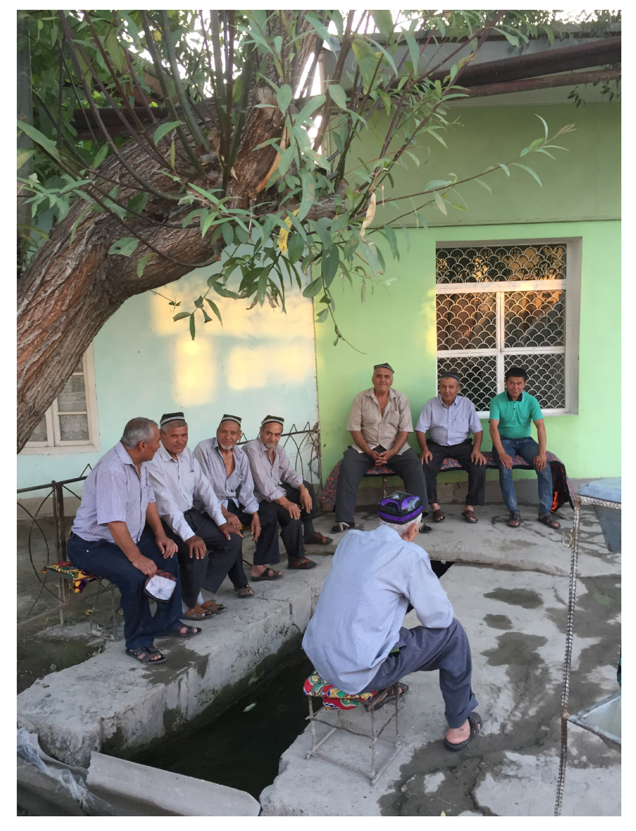
FIGURE 6. Villagers conducting daily information exchanges. August 2014.

We are currently spreading gossip about Misha in the village. We hope this shaming strategy will yield some sort of result. If Misha's parents continue to ignore us, we will contact Uzbek law-enforcement bodies, for example, uchastkovoy (local police), prokuratura (a public prosecutor), or SNB (National Security Service). But, we won't rush to resort to these measures. Misha is our neighbor, and we don't want to ruin