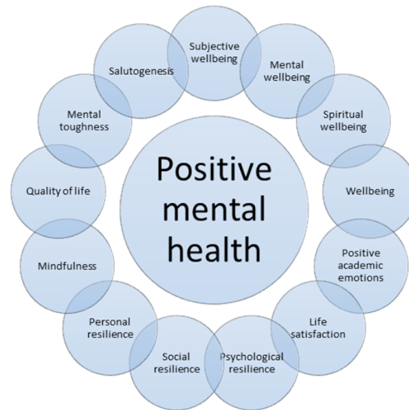
Figure 2: Dimensions of Positive Mental Health Included in the Studies