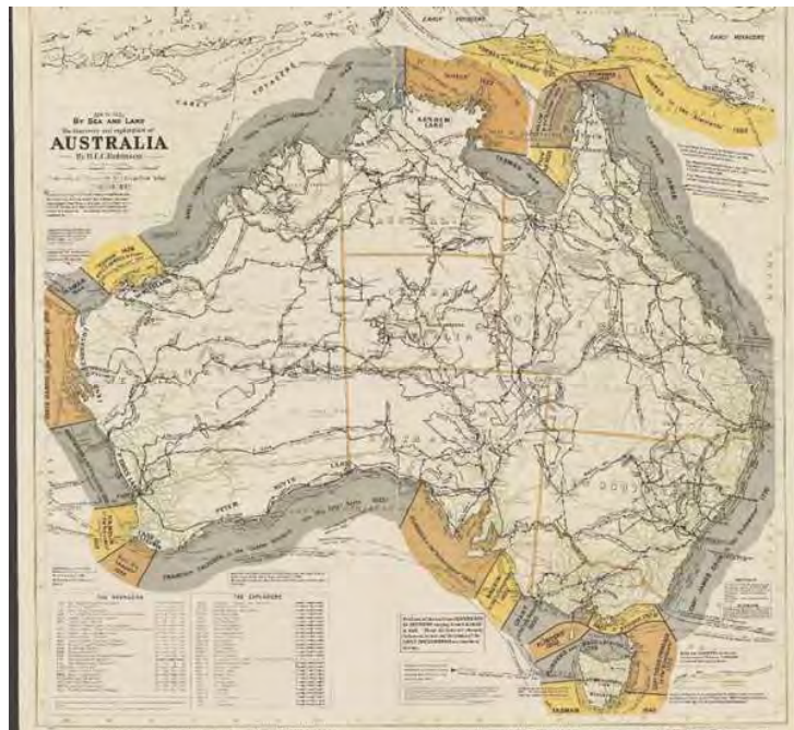
Figure A.2. European exploration routes by Robinson (1927)

Notes: The unit of observation is a grid cell of 10km X 10km. The dependent variable is a dummy variable that takes the value of 1 if cell i has nightlight, and 0 otherwise. This variable uses data from Visible Infrared Imaging Radiometer Suite (VIIRS) sensor. All columns control for local government fixed effects, as well as for a set of geographical, climatic and historical variables, which include: the coordinates of each grid cell, agricultural suitability, elevation, ruggedness (standard deviation of elevation), rainfall and standard deviation of rainfall, temperature and standard deviation of temperature, distance to the sea, distance to Sydney, distance the state capital, distance to historical mines, and water percentage. The descriptions of the geographical, climatic, and historical variables can be found in the Appendix. Column (1) excludes from the sample cells with Aboriginal trade routes and all their tangents that may or may not host a pre-colonial trade route. Column (2) is regression based on an analysis of contiguous pairs, which include pair-fixed effects, following equation 2 from section 3.5.2.2. Robust standard errors clustered at the local government district level were used and the constant term was omitted for space. *, ** and *** mean that the coefficient is statistically significant at 10%, 5% and 1% respectively.