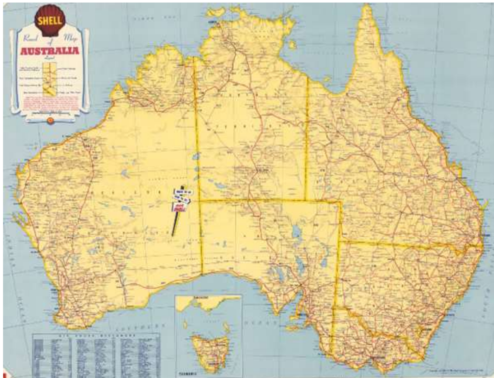
Figure A.4. Highway network in Australia by 1950

Notes: The unit of observation is a grid cell of 10km X 10km. The dependent variable is a dummy variable that takes the value of 1 if cell i has nightlight, and 0 otherwise. This variable uses data from the Visible Infrared Imaging Radiometer Suite (VIIRS) sensor. Column (1) controls for local government fixed effects, as well as for a set of geographical, climatic and historical variables, which include: the coordinates of each grid cell, agricultural suitability, elevation, ruggedness (standard deviation of elevation), rainfall and standard deviation of rainfall, temperature and standard deviation of temperature, distance to the sea, distance to Sydney, distance to the state capital, distance to historical mines, and water percentage. The descriptions of the geographical, climatic, and historical variables can be found in the Appendix. Robust standard errors clustered at the local government district level were used and the constant term was omitted for space. *, ** and *** mean that the coefficient is statistically significant at 10%, 5% and 1% respectively.