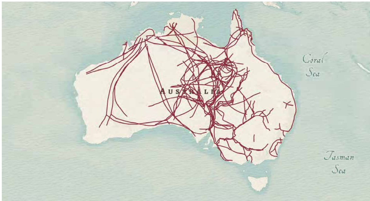
Figure A.1. Pre-colonial Aboriginal trade routes in Australia: McCarthy's maps

Notes: The unit of observation is a grid cell of 10km X 10km. The dependent variable is a dummy variable that takes the value of 1 if cell i has nightlight, and 0 otherwise. This variable uses data from Visible Infrared Imaging Radiometer Suite (VIIRS) sensor. In column (1), cells with the bottom 25% rainfall and temperature were excluded. In column (2), cells with the top 25% rainfall and temperature were excluded. All columns control for local government fixed effects, as well as for a set of geographical, climatic and historical variables, which include: the coordinates of each grid cell, agricultural suitability, elevation, ruggedness (standard deviation of elevation), rainfall and standard deviation of rainfall, temperature and standard deviation of temperature, distance to the sea, distance to Sydney, distance to the state capital, distance to historical mines, and water percentage. The descriptions of the geographical, climatic, and historical variables can be found in the Appendix. Robust standard errors clustered at the local government district level were used and the constant term was omitted for space. *, ** and *** mean that the coefficient is statistically significant at 10%, 5% and 1% respectively.