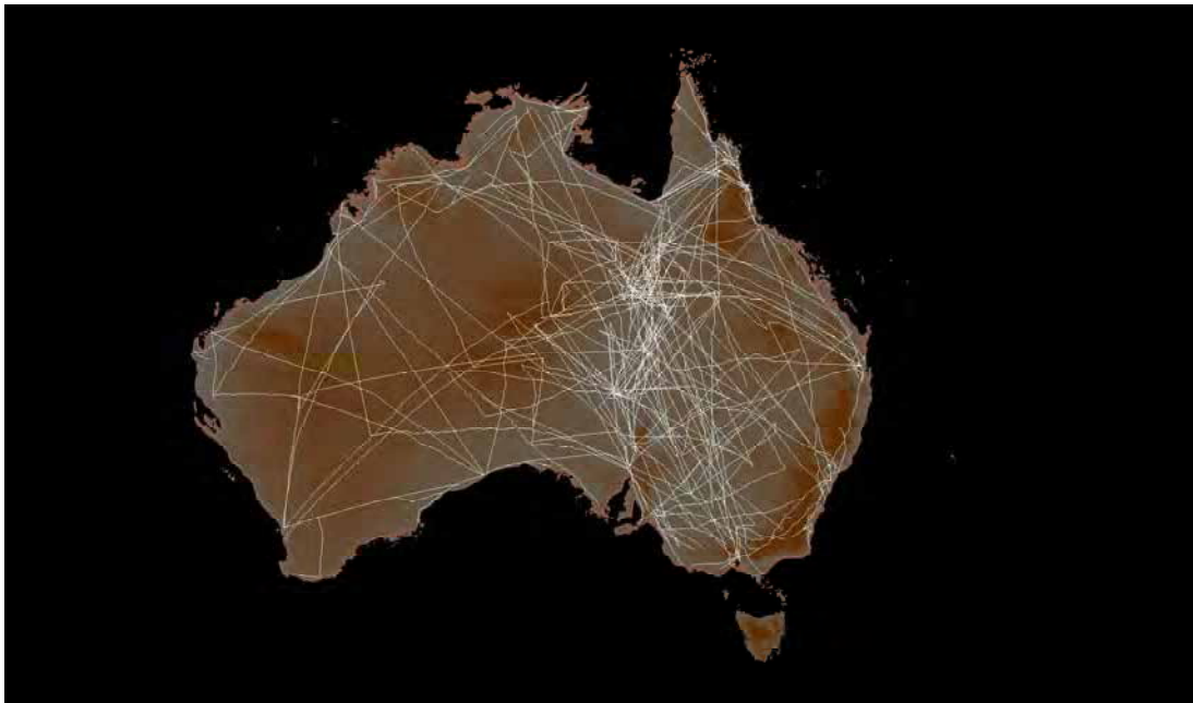
Figure 1. Aboriginal trade routes in Australia

between two locations, considering certain parameters such as obstacles. For instance, altitude and slope can be considered as costs that are typically avoided by travellers. In this present paper, the main variables of interest are the time taken to traverse a location, as greater travel time is generally seen as less favourable for walking. To illustrate, if a mountain range separates two locations, a person may opt to divert across the plain in order to avoid the mountainous route. Therefore, our constraint is travel time and the LCP is employed to identify the most advantageous paths.