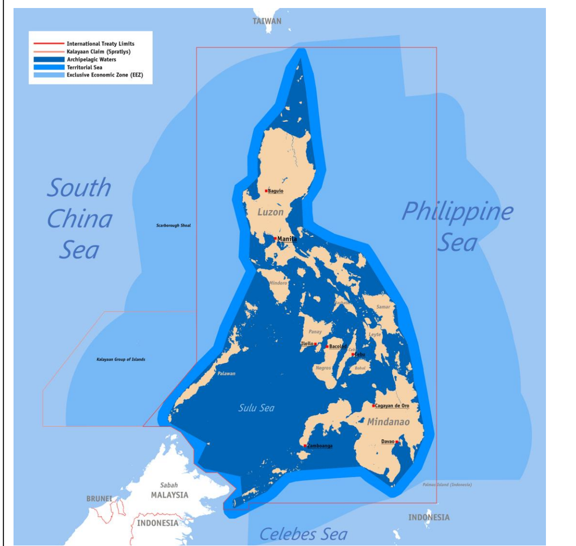
Figure 1 Philippine EEZ

The great majority of the Philippines population lives in coastal areas (Palomares et al. 2014). Given this, the Philippines geographical features and the biological productivity of the inshore areas, it is not surprising that fisheries play a significant role in the nation’s economic and social makeup. Fish consumption is high compared to the rest of the world. According to Lamarca (2018) it was about 40 kg/capita per year in 2017 or almost 110 grams/capita per day.