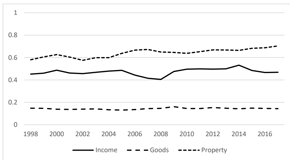
Figure 2. Coefficient of Variation for Different Taxation Categories: 1998-2017

Source: OECD. See https://stats.oecd.org/Index.aspx?DataSetCode=RS_GBL for more details.