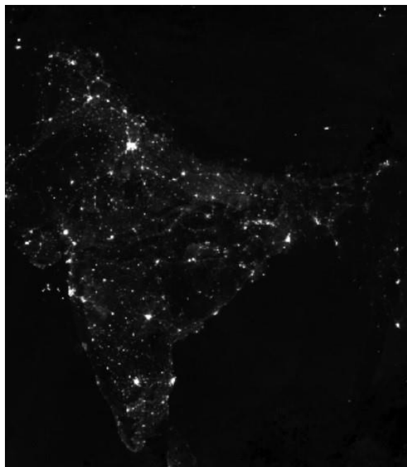
Figure 3: Nightlight Intensity of Indian Subcontinent

State-wise average market access is provided in the table below (Table 1):