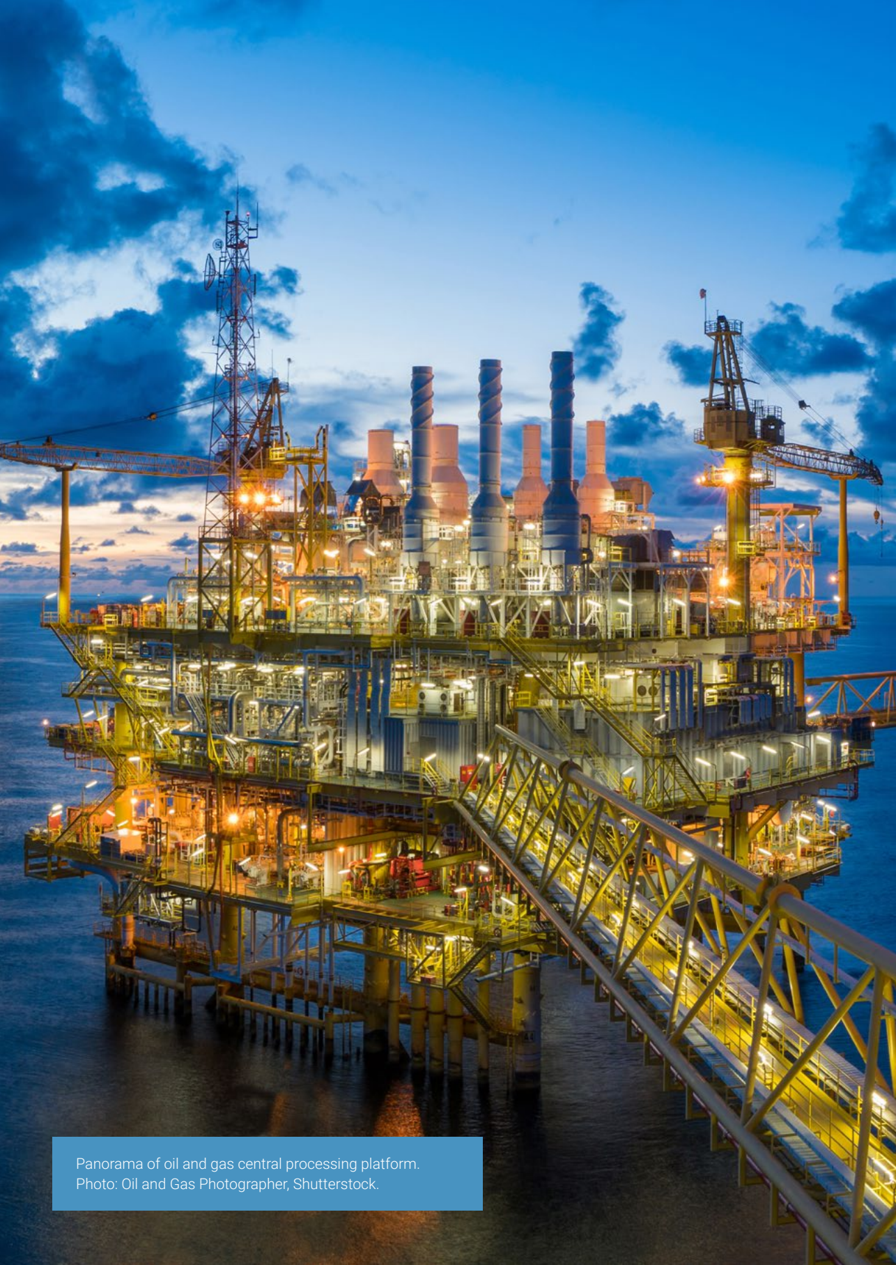
Panorama of oil and gas central processing platform.