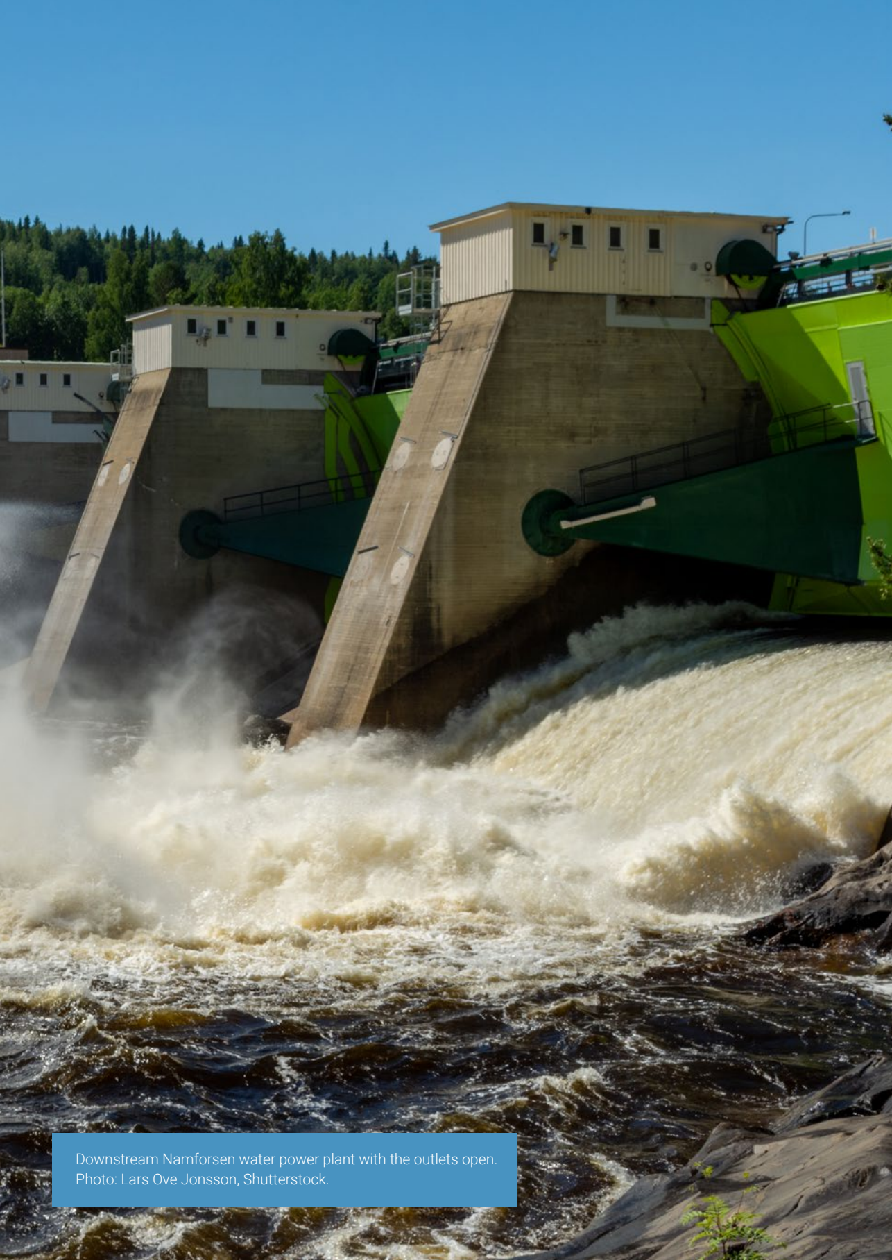
Downstream Namforsen water power plant with the outlets open.