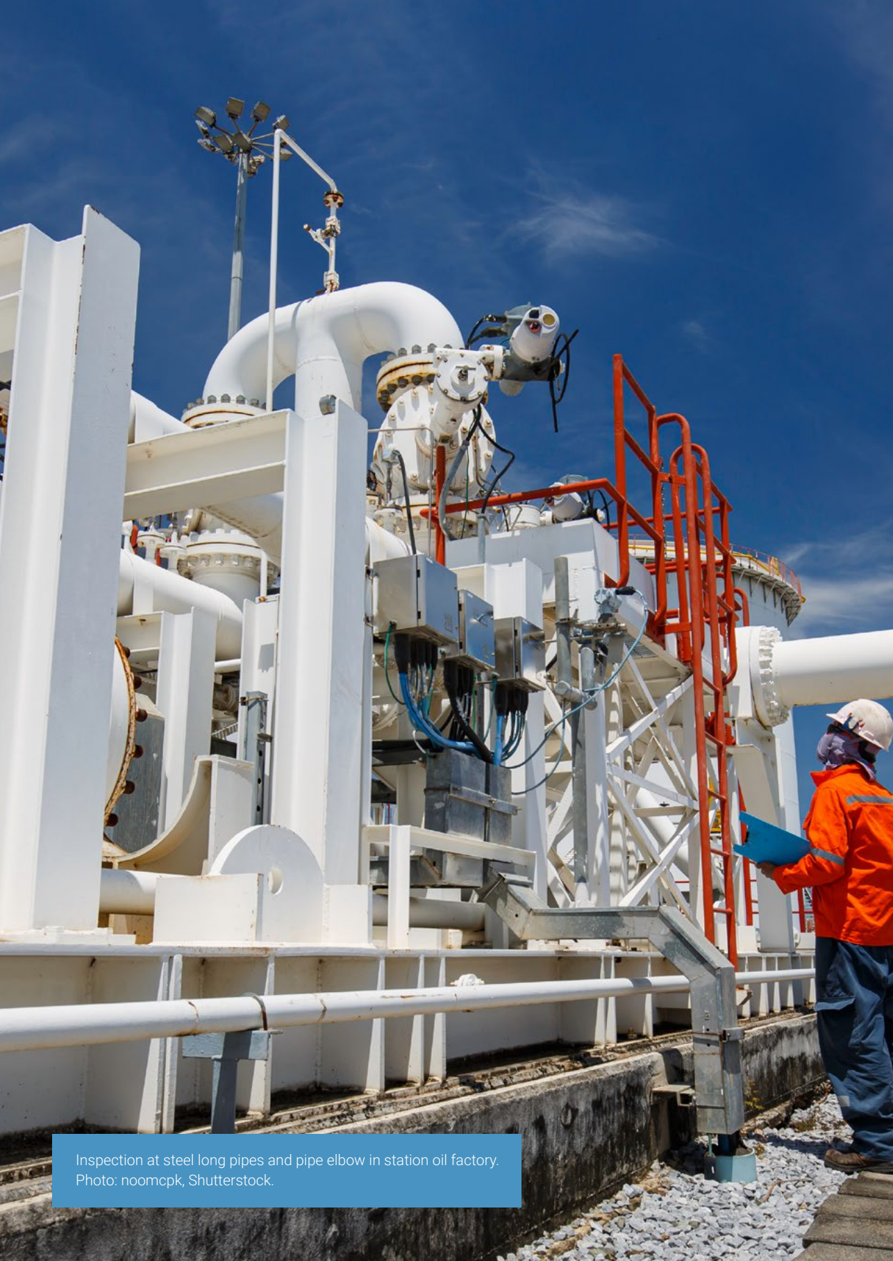
Inspection at steel long pipes and pipe elbow in station oil factory.