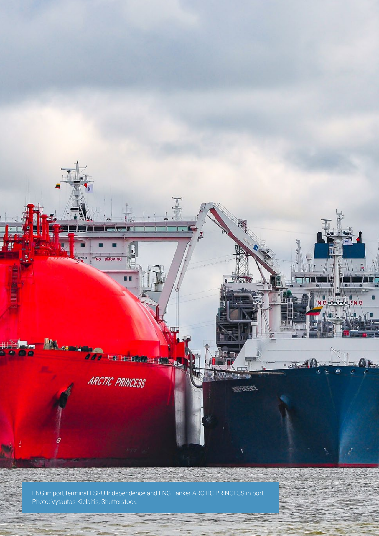
LNG import terminal FSRU Independence and LNG Tanker ARCTIC PRINCESS in port.