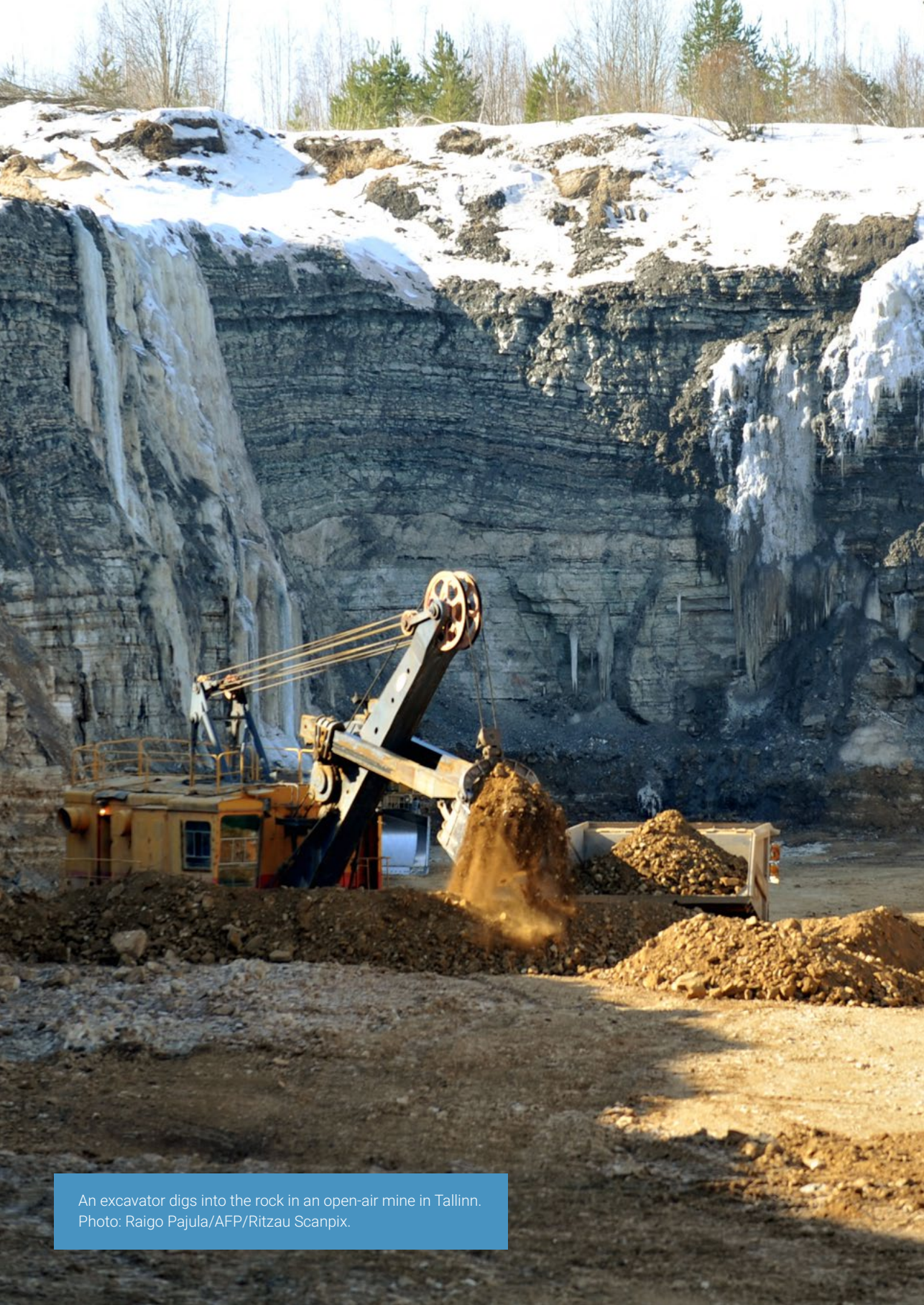
An excavator digs into the rock in an open-air mine in Tallinn.