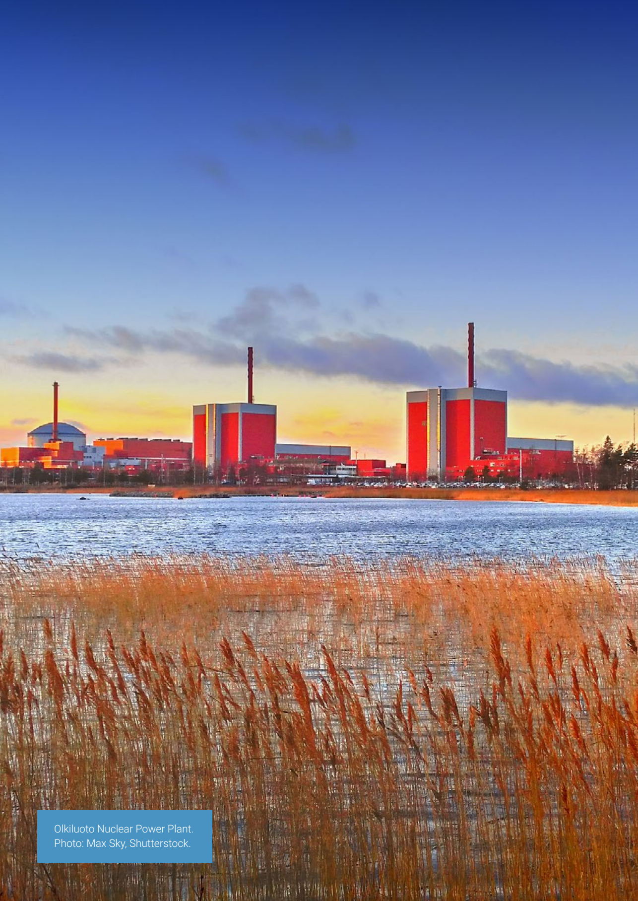
Olkiluoto Nuclear Power Plant.