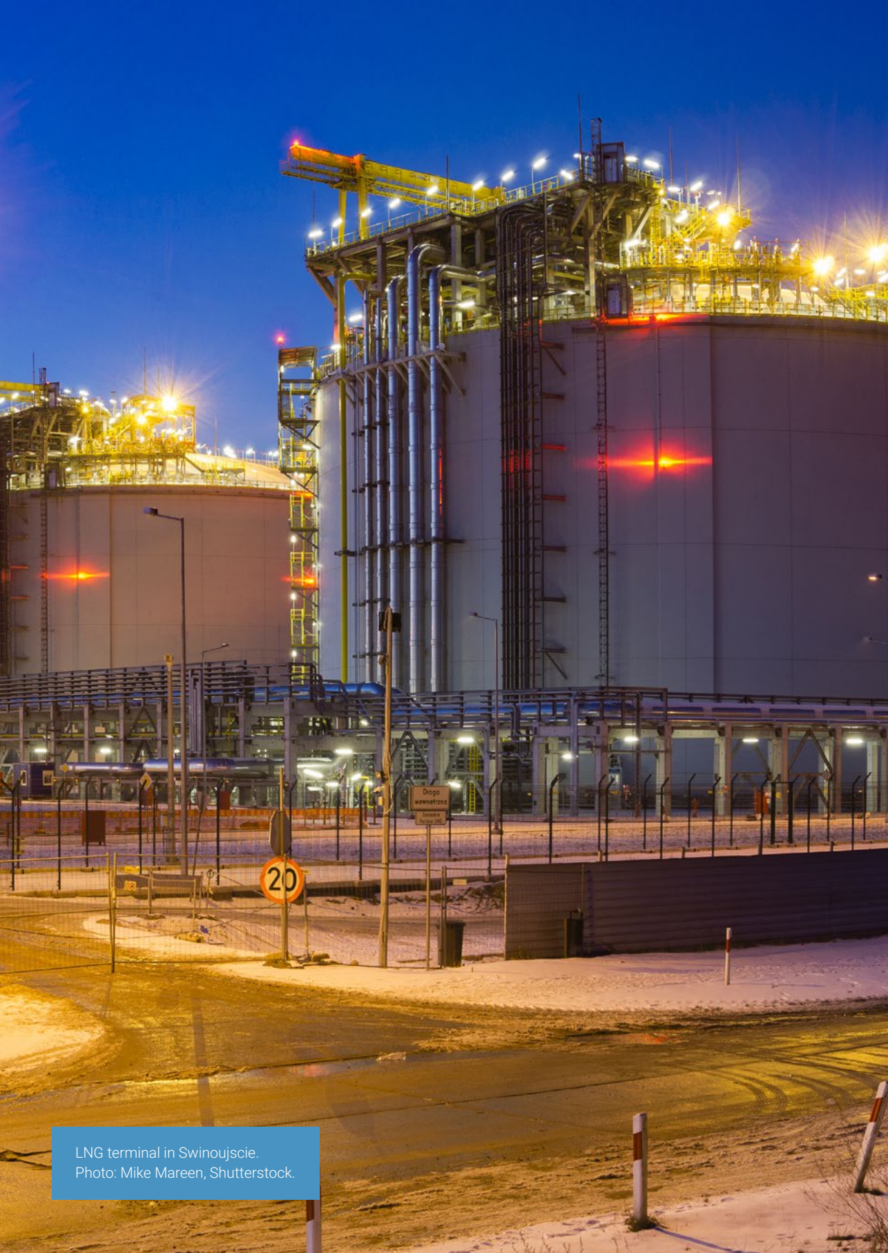
LNG terminal in Swinoujscie.