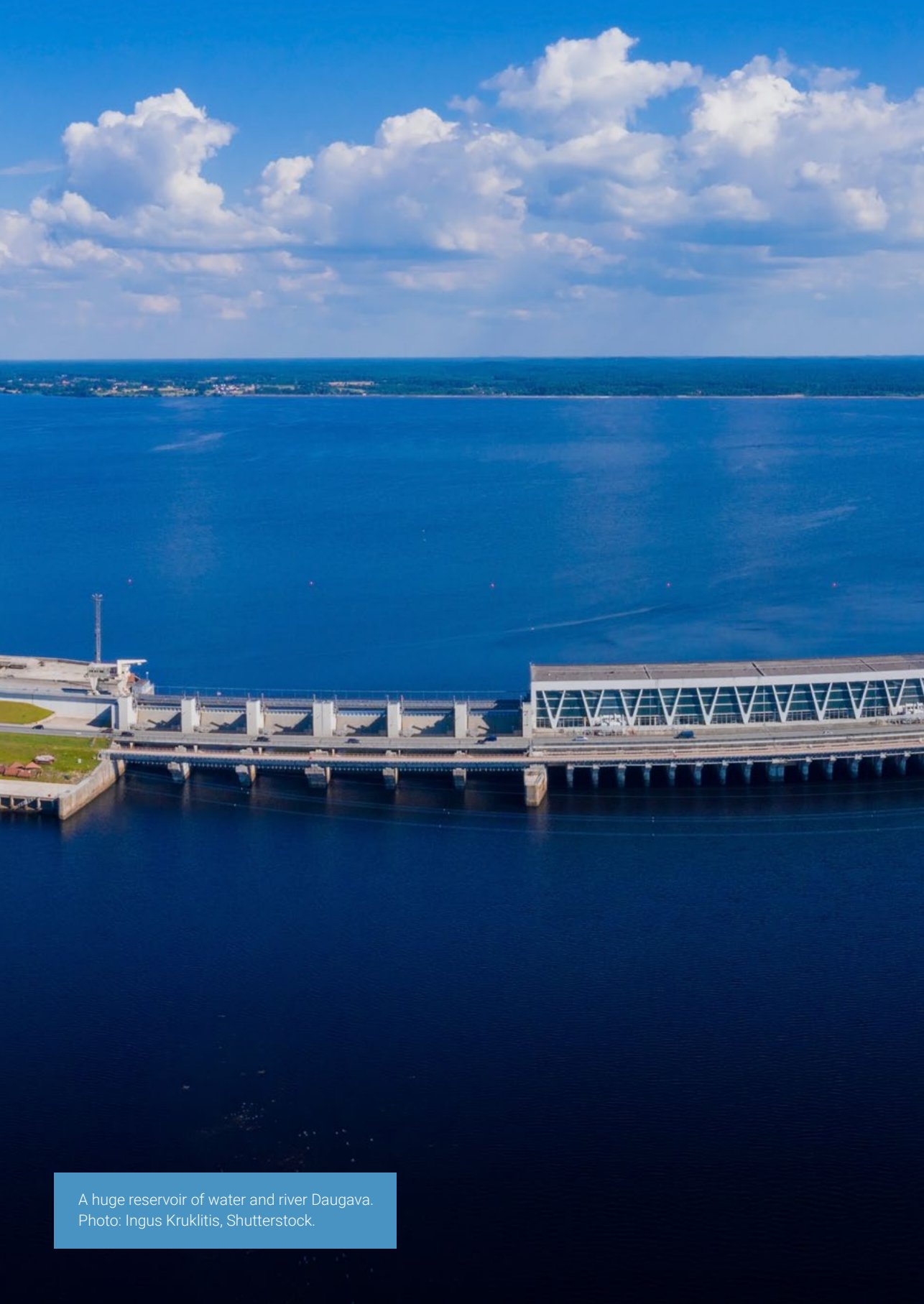
A huge reservoir of water and river Daugava.