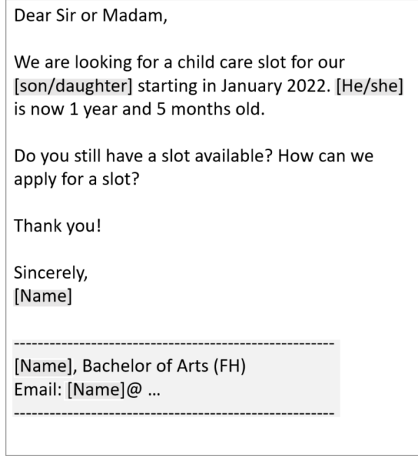
Figure 1: Email Template with Randomized Information Highlighted

Notes: Figure shows the email sent from fictitious parents to child care centers, translated from the original German version. Text marked in grey is randomized and differs by version of the email. We randomized the gender of the child (2 variations), the name of the parent (16), and whether or not we include an email signature (2). The signature indicates that the parent holds a bachelor's degree from a University of Applied Sciences, which is the most common university degree in Germany. We sent a total of 64 ( 2 \times 16 \times 2 ) different versions of the email to child care centers.