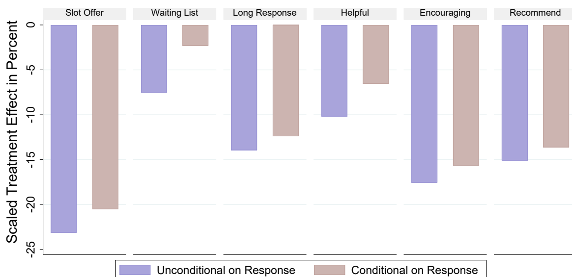
Figure 3: Scaled Treatment Effects on Response Content

Notes: Figure shows scaled treatment effects for email content outcomes, based on the multivariate OLS models shown in Table 3. Scaled treatment effect expresses the treatment effect relative to the sample mean (unconditional on response) of the respective outcome in the native control group.