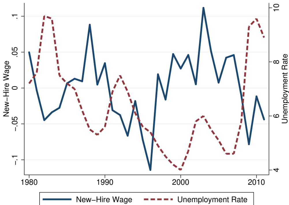
Figure 2: Time Series of the Quality-Adjusted New-Hire Wage

Notes: The unemployment rate (right scale) is in percentage points. The new-hire wage (left scale) is in terms of percent and is normalized to average zero for the sample period (e.g., 0.1 means 10 percent above sample-period mean).