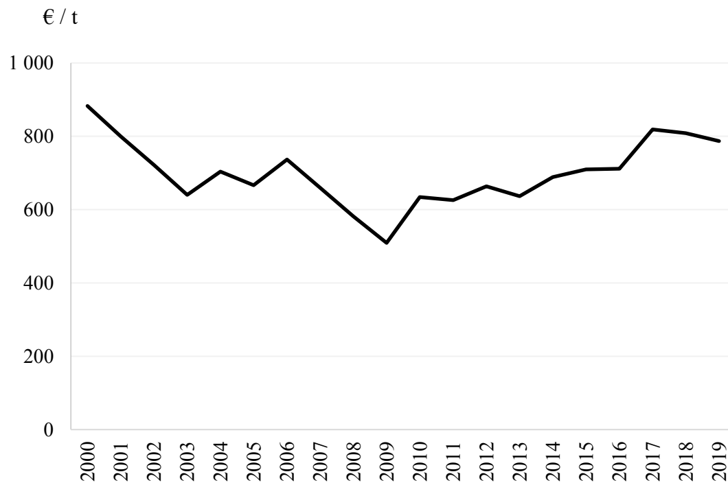
Figure 1. Carbon productivity of the Finnish manufacturing sector in 2000–2019, measured in euros per tonne of GHG (prices of 2015, GHGs in CO 2 equivalents).