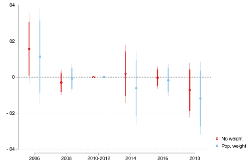
(b) Turnout in High Hisp. v. Low Hisp. Census Blocks

Notes: In each panel, estimates depicted are from two separate specifications: one without weighting (red dots, on the left of each pair), one weighted by Census block population (blue dots, on the right of each pair). Reported estimates are the High [Black OR Hisp.] Block*Covered*[Year] coefficients, estimated relative to the Census blocks in the “Low [Black OR Hisp.]” category. Both include county-by-year fixed effects, Census block race dummies-by-year fixed effects, and Census block-by-midterm fixed effects. Thicker lines depict 95% confidence intervals; thinner lines depict 99% confidence intervals.