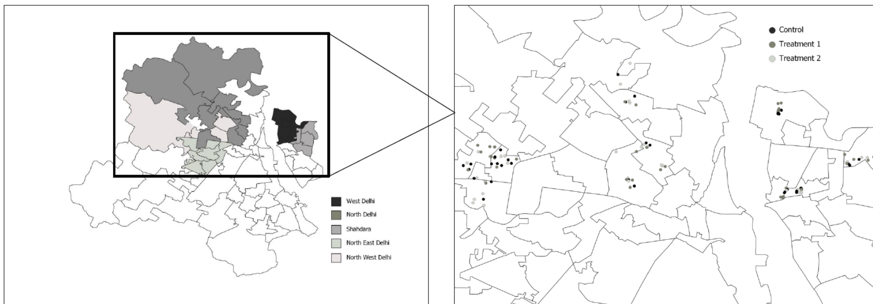
Figure 1: Sampled districts, and polling stations by treatment status