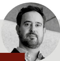
Ralph De Haas

Our results have two important implications for the expansion of LGB rights in parts of the world where anti-LGB attitudes are widely held and deeply ingrained. First, they clearly suggest that individuals in countries with strong views about the immorality of homosexuality can—when informed about the economic costs of sexual-orientation discrimination—still voice support for non-discrimination policies. This