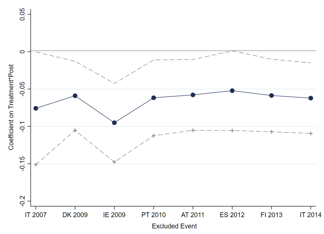
Figure A1: Tax-hike spillover: excluding one event at a time

This figure shows the coefficients on Tax\ hike \times Post from the regression in equation (10), excluding one event (i.e., tax hike) at a time. We include firm controls in all regressions. The gray line represents the 95% confidence interval.