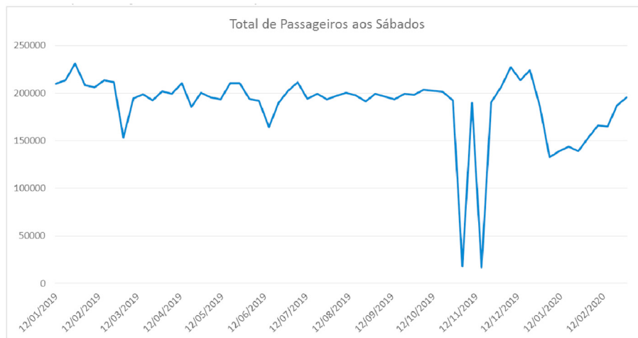
Graph 2. Total passengers on Saturdays.