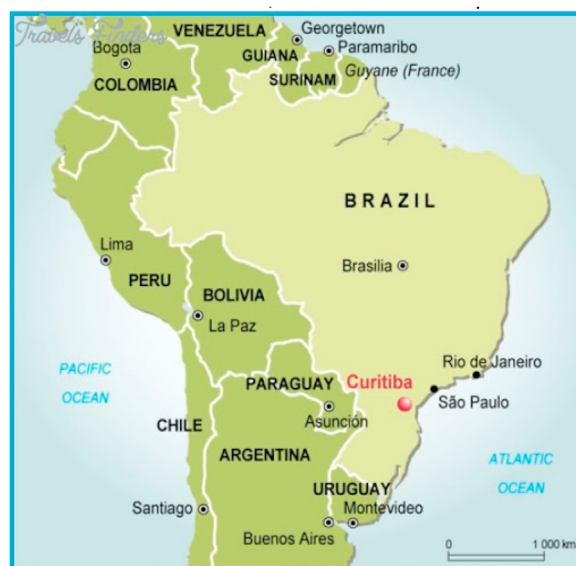
Fig. 1. Curitiba's location in Brazil/South America map.