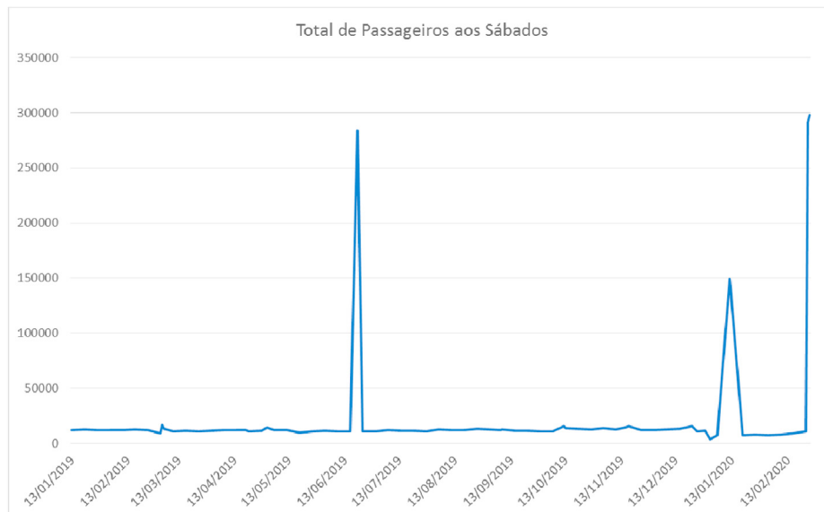
Graph 3. Total passengers on Sundays/Holidays.