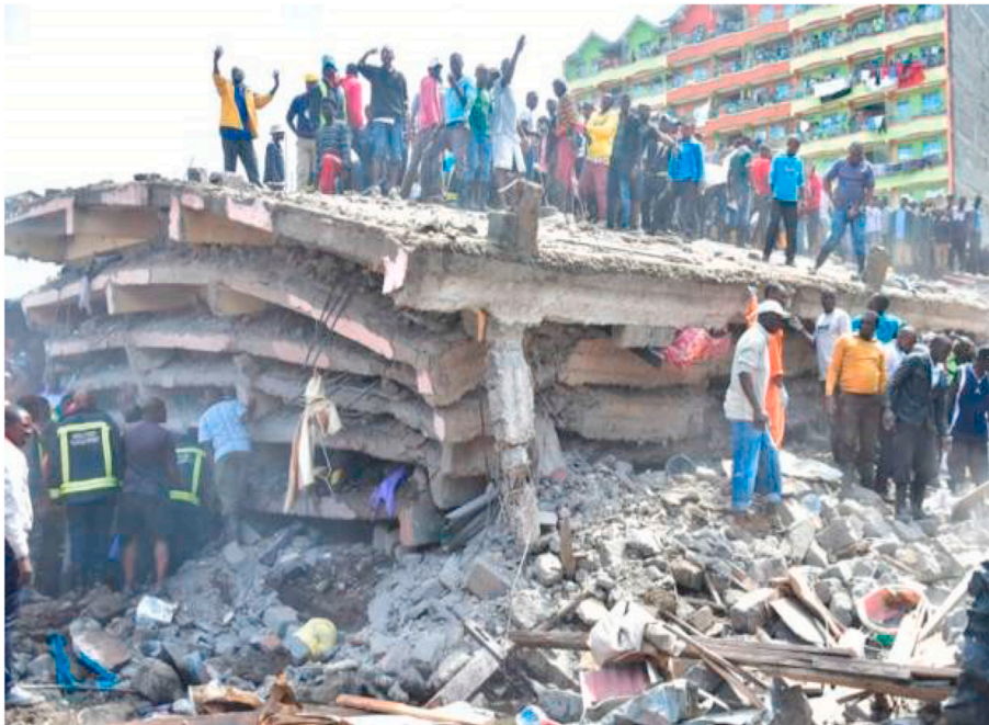
Fig. 1. The absence of urban resilience in Kenya. Did this building receive a planning approval (land-use and design) and building consent (its structure)?