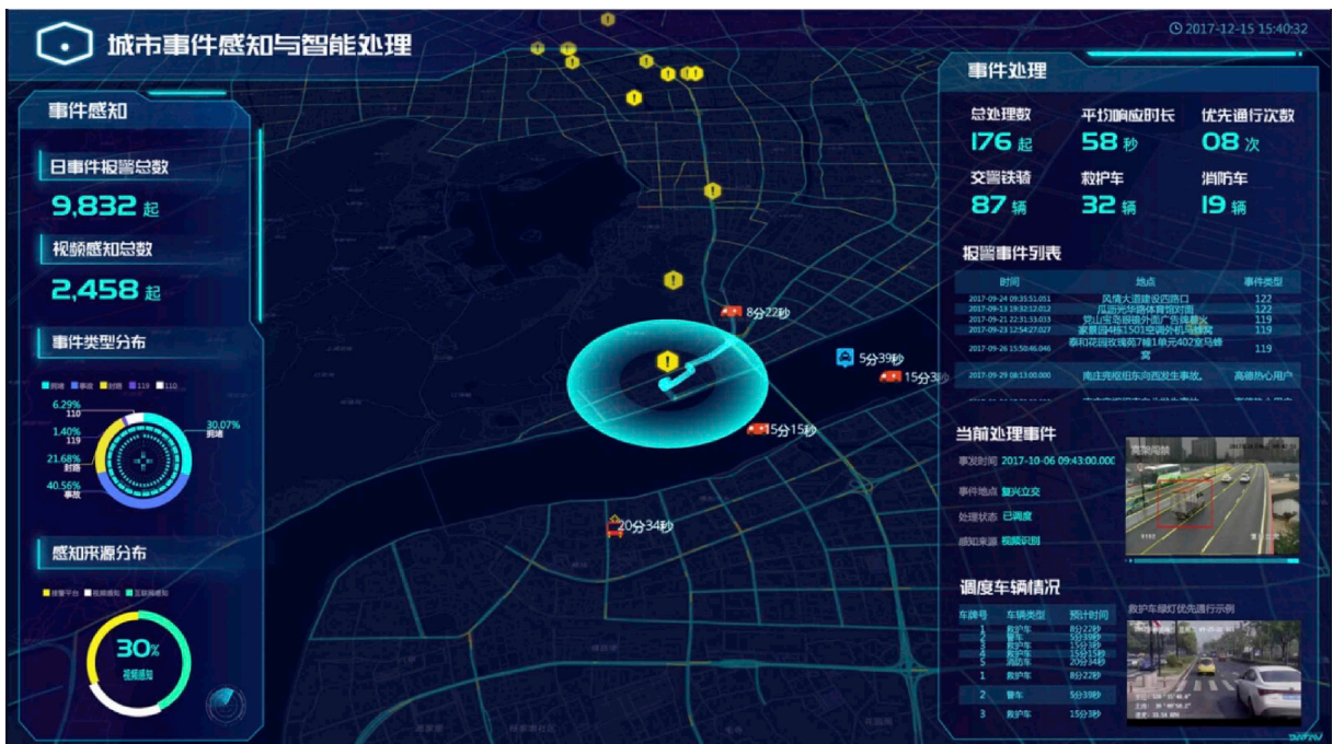
Fig. 3. The sensing, processing and actuation (SPA) system of City Brain, Alibaba.

Alibaba, the largest e-commerce company of China, has developed the ET City Brain (ETCB) system in cooperation with the city of Hangzhou (population of about eight million) in Zhejiang Province, integrating public administrative data, Internet cloud data, IoT sensing data, and image sensing data for the purpose of urban management (see Fig. 3). The functions of City Brain are designed with the concept of one keyboard, one standard, one cloud and one network, displayed with a common interface, standardized specifications, shared database, AI support, and ubiquitous access. By joining ETCB, governmental departments such as natural conservation, police, urban utilities, healthcare, hospitals, and road transportation can allocate their resources dynamically in response to events in the physical world. The system was first tested in Xiaoshan Ward and then applied to the entire downtown area of Hangzhou. Thanks to the system, it has been reported that vehicle speeds have increased by 15% in Shaoshan Ward and traffic accidents can now be detected automatically with an accuracy of 92% in the city.