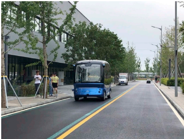
(a) Driverless bus

The concept of City Brain was also introduced in the Xiong'an New Area, a state-level new development project located 100 km southwest of Beijing, 50 km east of downtown Baoding and 100 km west of Tianjin. As a leading-edge development project initiated directly by President Xi Jinping, the planning, design and construction of the area are being conducted in innovative ways. Every detail of the new area is first designed in the cyber world using building information modeling (BIM) and city information modeling (CIM). Physical components are constructed based on the design, and then monitored and managed digitally in the cyber world. This is called a twin-city development, which means that the components built up in the physical world will be mirrored simultaneously in the cyber world. This technology has been applied in the construction of the Public Service Center district and trial demonstrations were deemed a great success (see Fig. 4). The start-up zone and infrastructure projects are under ongoing construction.