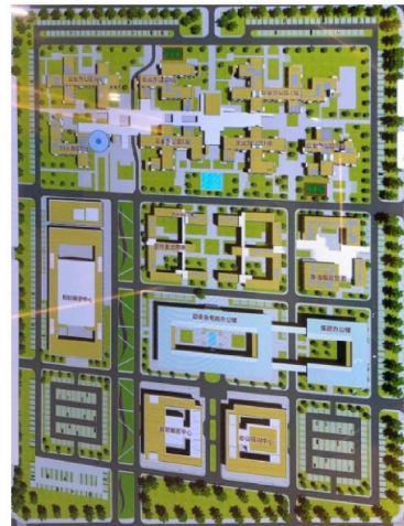
(d) Layout of Public Service Center district