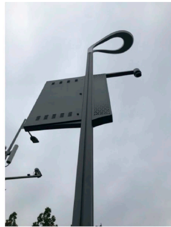
(b) Poles equipped with multiple sensors