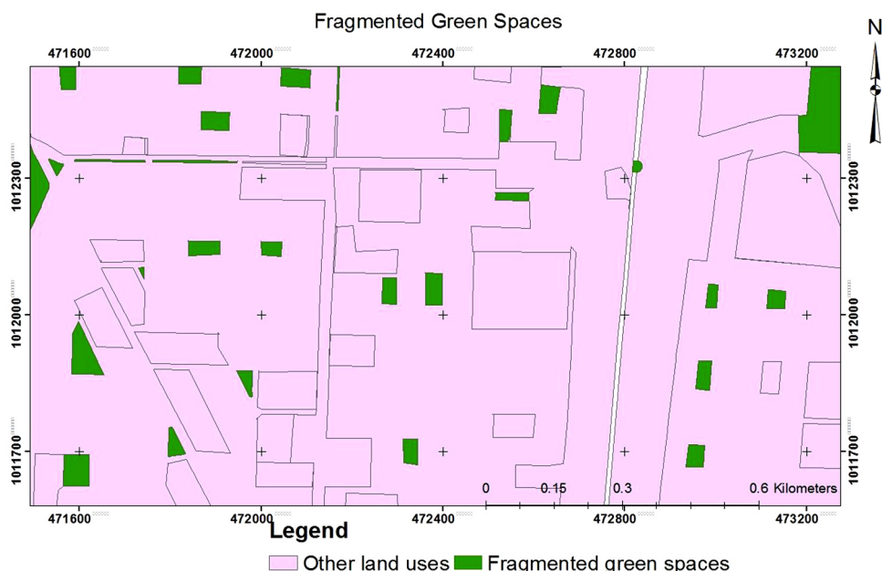
Fig. 2. Planned green spaces in the structural plan.

“...I don't think there's awareness of the concept of green infrastructure planning at all in the local community, planners, policy and