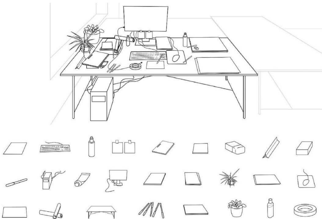
Fig. 2. Workplace of an urban designer and list of individual objects on the table: pieces of paper, keyboard, disinfectant spray, sticky notes, notebooks, stack of paper, eraser, ruler, box, pens, calculator, tube, monitor, plants, transparent paper roll, vial and an adhesive tape. Visualisation: Niklas Kuckeland.