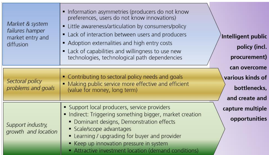
Figure 1: The multiple rationale of demand side innovation policy