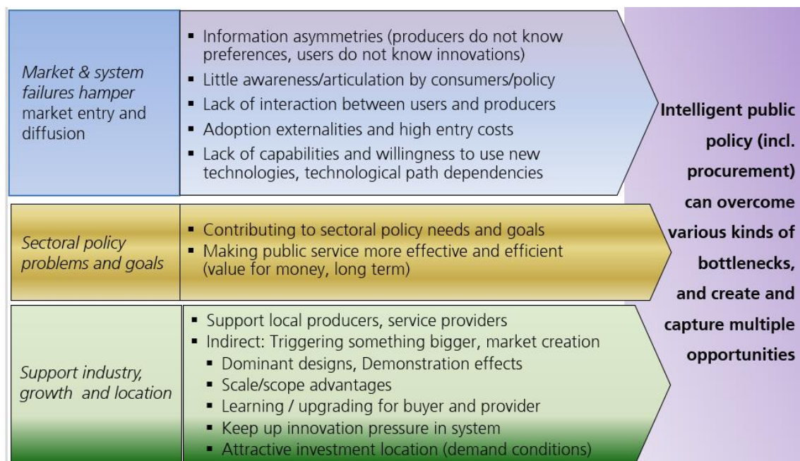
Figure 1: The multiple rationale of demand side innovation policy