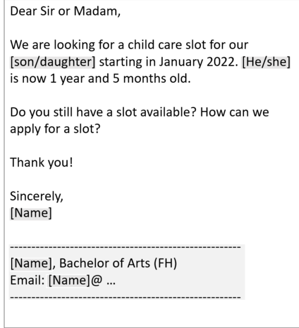
Figure 1: Email Template with Randomized Information Highlighted

Notes: Figure shows the email sent from fictitious parents to child care centers, translated from the original German version. Text marked in grey is randomized and differs by version of the email. We randomized the gender of the child (2 variations), the name of the parent (16), and whether or not we include an email signature (2). The signature indicates that the parent holds a bachelor's degree from a University of Applied Sciences, which is the most common university degree in Germany. We sent a total of 64 ( 2 \times 16 \times 2 ) different versions of the email to child care centers.