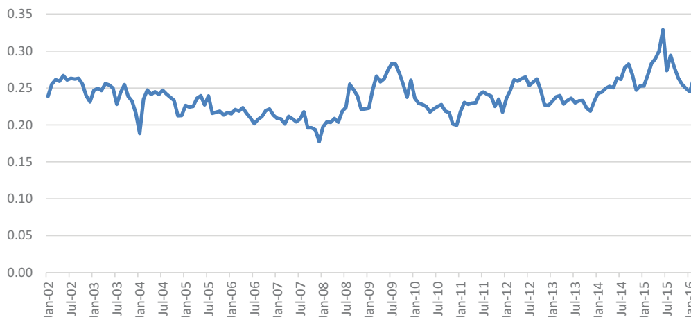
Figure 1. Trend of dollarization in Ghana (Jan 2002–Mar 2016).

Figure 1 presents the trend of dollarization in Ghana for January 2002 to March 2016. The average proportion of FCD in broad money has been 24% over the period. The highest proportion of FCD in broad money has been 28.83% for October 2000 and the least share was recorded as 17.75% in December 2007. Tweneboah (2016) asserts that the figures portray that there have been sizable and persistent growth rates in FCD and indicate the important role of FCD in domestic banking