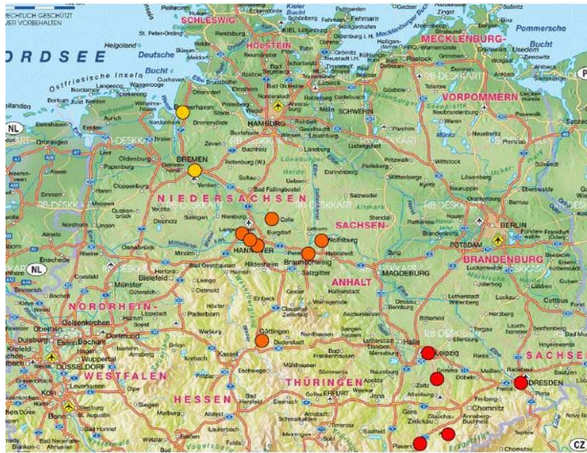
Figure A1: Pro Kind Locations

Note: Orange points indicate locations in Lower Saxony, yellow points in Bremen, and red points in Saxony.