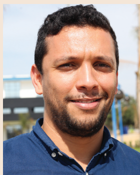
El Mehdi Ferrouhi

JEL Classifications: C22; G10; G11; G15; G17