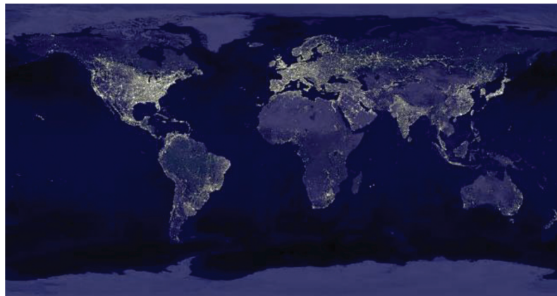
Figure 1. a) Dark and light inspection: source: eco browser, analysis of current economic conditions and policy, http://apod.nasa.gov/apod/ap001127.html ; collected from the images sent by DMSP satellites: http://heasarc.gsfc.nasa.gov/docs/heasarc/missions/dmsp.html , 2016.

Indeed, being landlocked does not necessarily condemn a country either to poor or slow growth, but 38 percent of the people living in bottom-billion societies are in landlocked countries. Expenses for