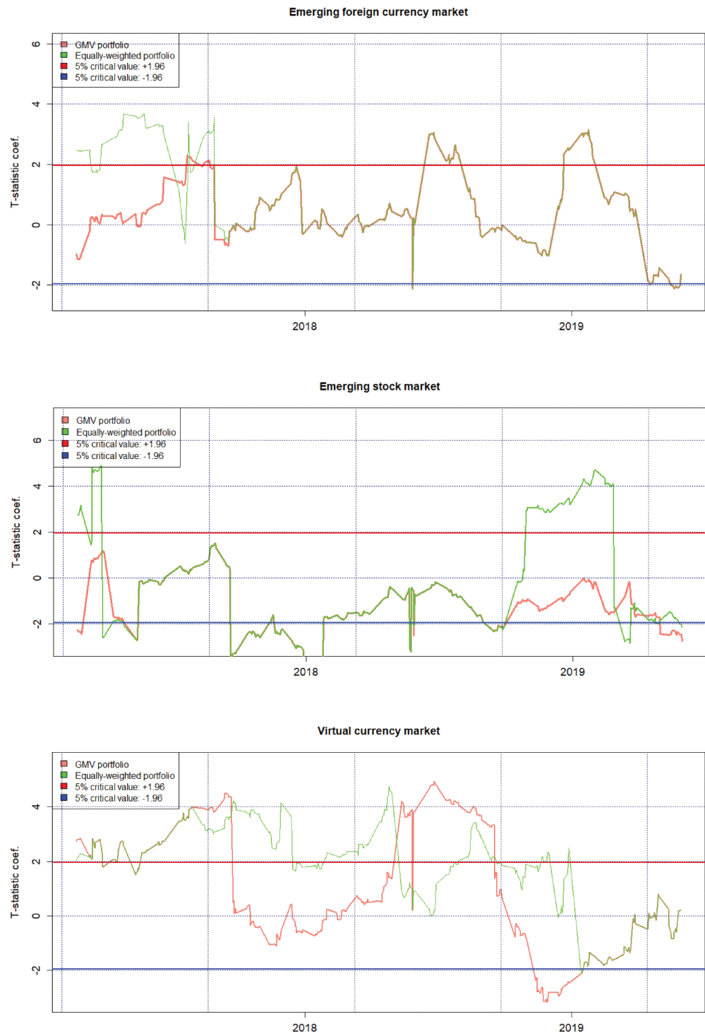
Figure 1. Time-domain evolution of \gamma_2 coefficient based on 80-day rolling window OLS estimation. note: (refer to the online version for colour representation).