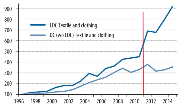
Figure 1b. The move to the single transformation rule under EBA (EU Textile and clothing imports LDCs vs. other developing countries)

Source: Authors from COMTRADE- Base: 1996=100. Vertical line indicates entry into effect of single transformation rule.