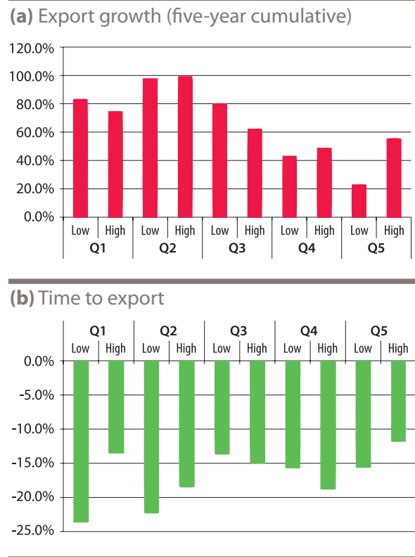
Figure 2. Export growth and time to export vs. lagged AFT, by quintile of the export per capita distribution

even though 80% of AFT in low-incomes is assigned to infrastructure development).