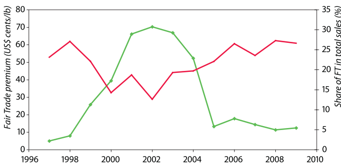
Figure 2. Fair Trade premium (inverted U curve) and share of certified production sold as FT

Over-certification is not the only mecha-