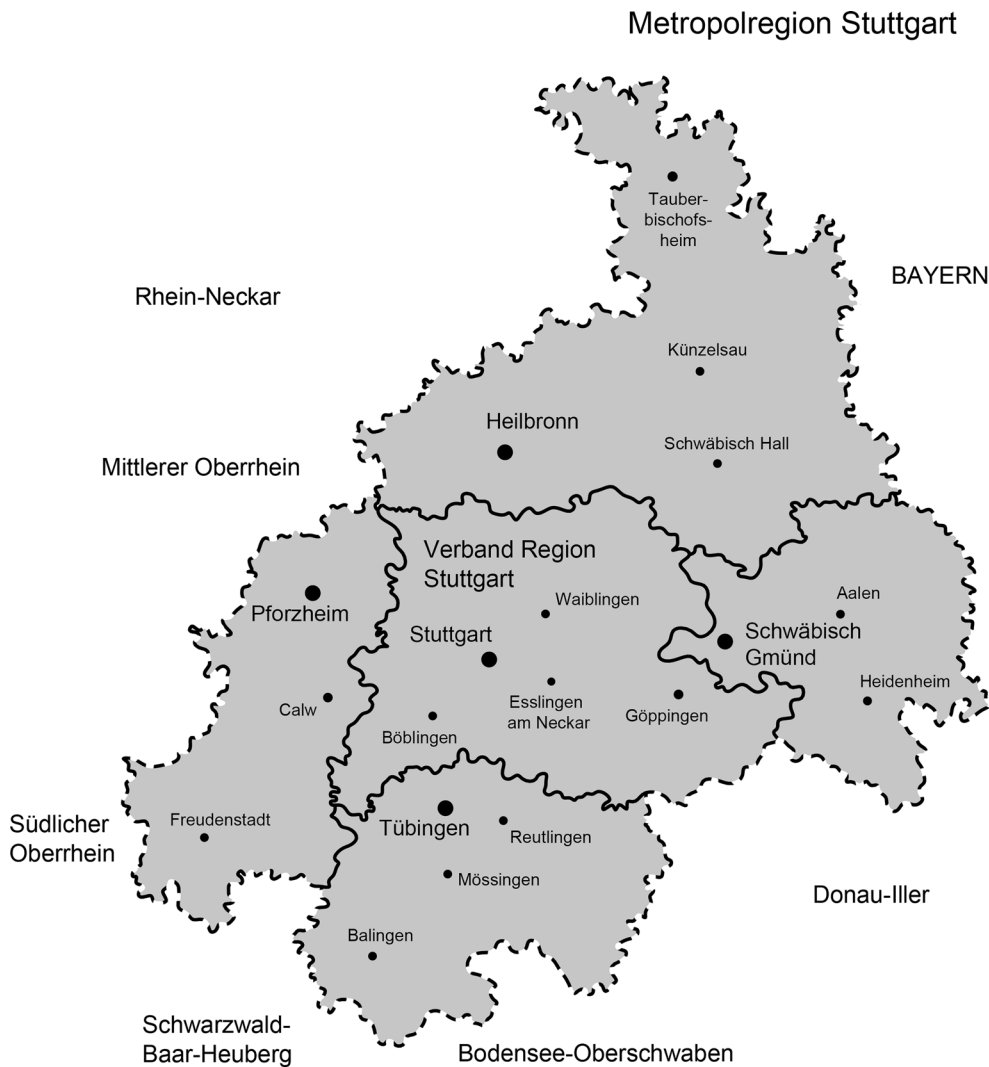
Figure 2 Verband Region Stuttgart (VRS) within the wider Stuttgart Metropolitan Region