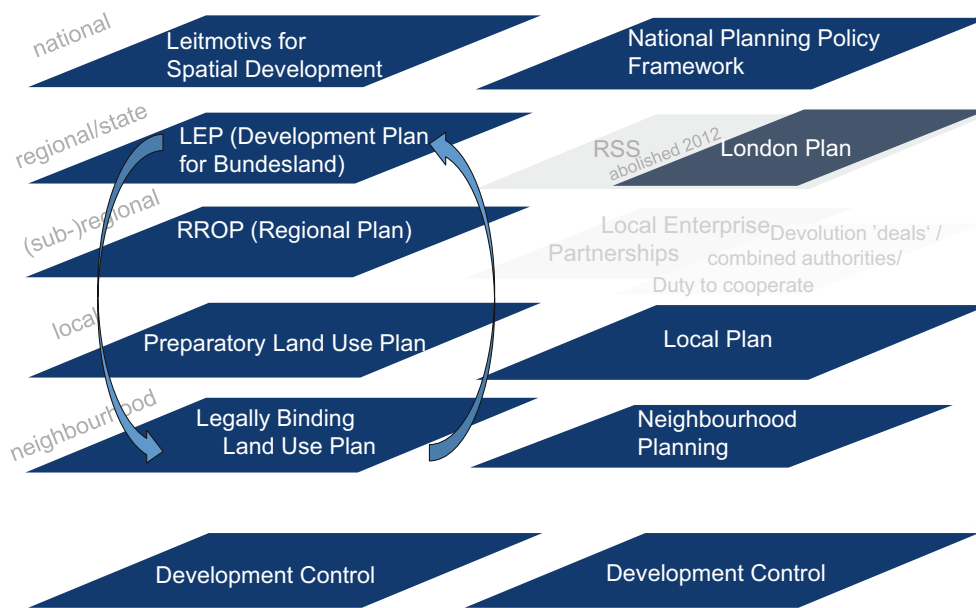
Figure 3 English and German planning tiers

and relevant actors are interlinked by a set of requirements of notification, participation, coordination and compliance across the different statutory planning documents, striving to strengthen the influence of spatial planning and aiming to avoid contradictory policies and plan designations.