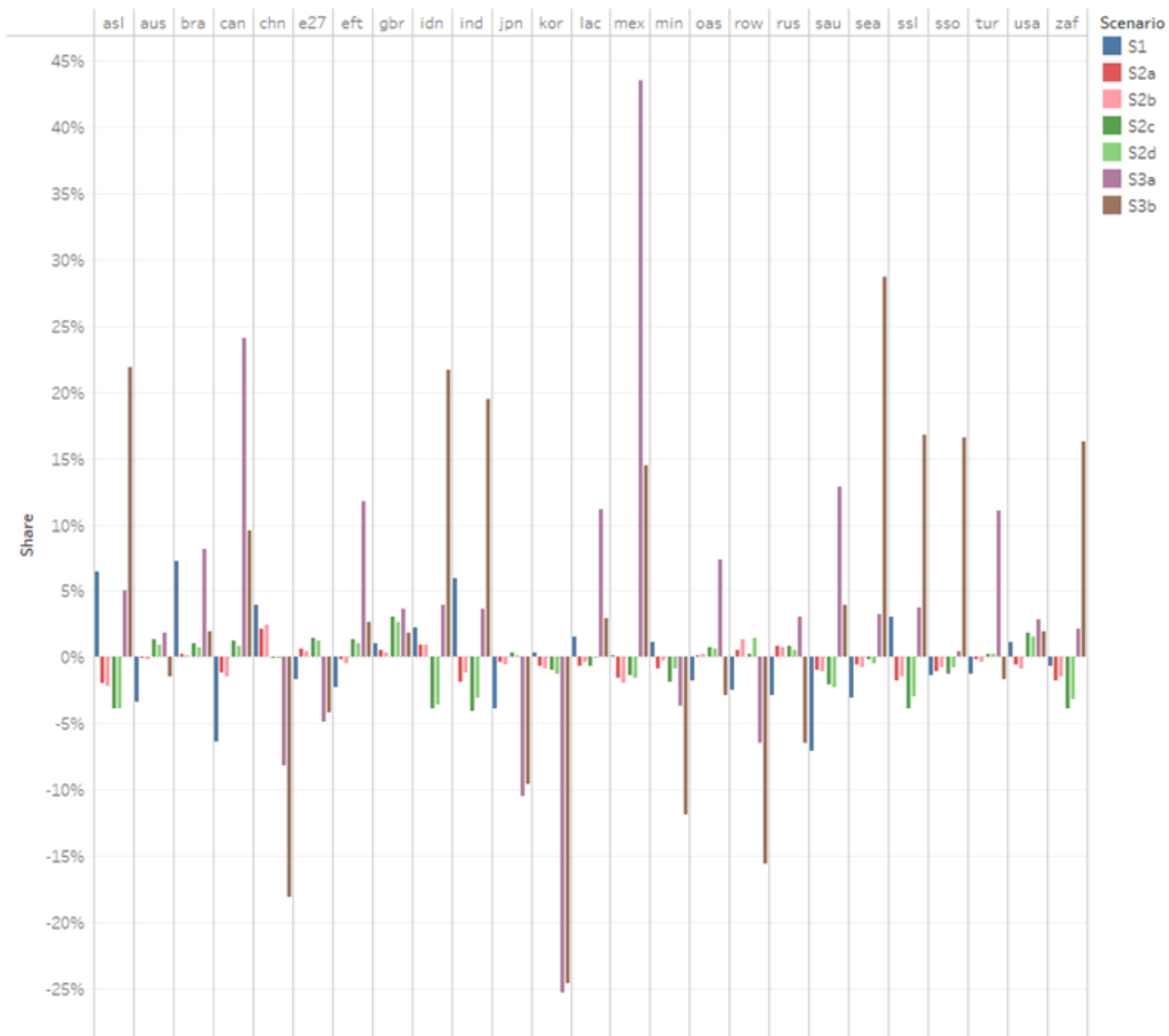
Figure 1: Variation in the share of regional exports in global trade - excluding intraregional trade (cumulative, 2020-2050)