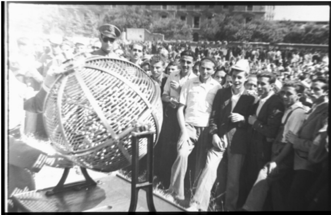
Figure 2 Draft lottery, Madrid 1966

Note: This picture shows the draft lottery conducted in 1966 in Madrid.