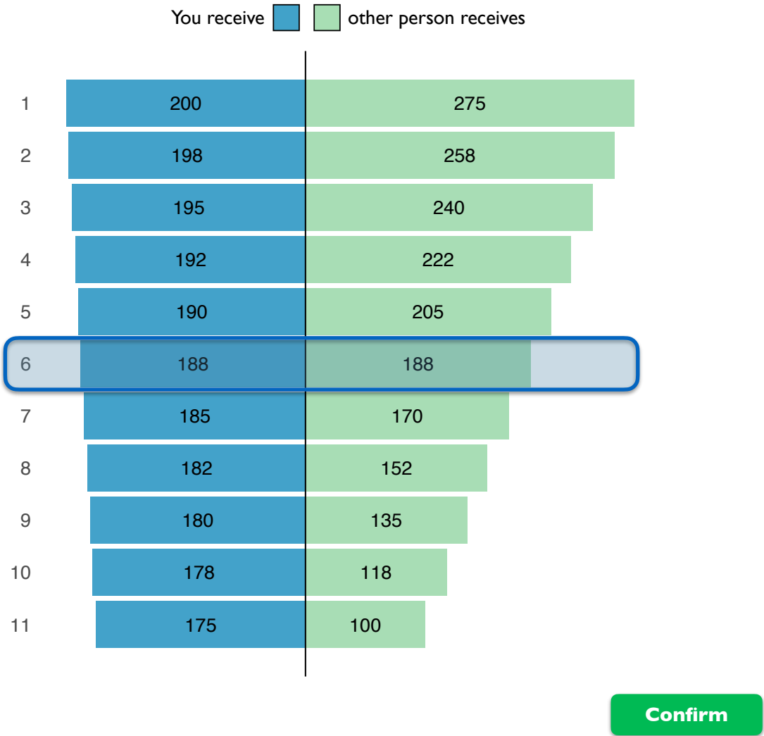
Fig. S1. Screenshot of online experiment eliciting social preferences

Notes: This is an example of one of the choice situations (Situation 9 in Table S8). The subject can choose one out of eleven payoff allocations where the blue bars to the left show the money received by the subject, while the green bars to the right show the money received by a randomly assigned other person. The individual has chosen option number six, which gives DKK 188 to each person.