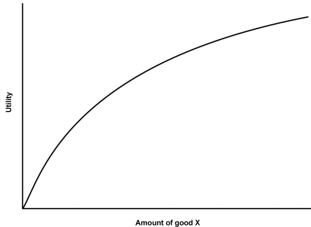
Fig. 1: Typical utility function for a good

would be willing to sell your produce for would depend on how much utility you would gain by receiving the payment but we cannot estimate that until we know how much we could buy with the shillings. This circularity problem with fiat money has been recognised by many economists, for example: