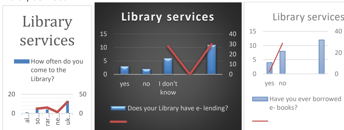
Figure 1 Library Services

Given all these advantages and disadvantages of e-books, we conducted a small survey among our students to see how they coped with finding literature during the pandemic. And how much they use electronic resources to fulfill their obligations to write seminar papers and finally graduate theses. We asked seven basic questions. The first question is how often or rarely do they visit the library? We wanted to see if more people use the classic library and printed materials or more people for whom the digital library and electronic sources come first (see Figure 1).