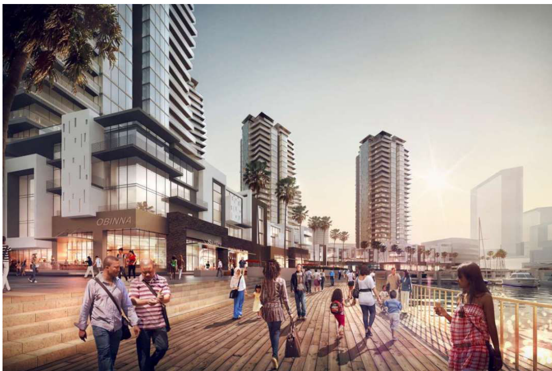
Figure 2. A rendering of the marina for Eko Atlantic.

In this context, our analyses furthermore revealed that because of this social complexity, the aspects that are atmospherically inscribed in renderings via digital collage are typically constructed in a collaboration between visual artists and architects, developers, and sometimes other actors as part of a longer planning process. As some visual artists described, integrating various stakeholders within the different planning phases and incorporating their points of view into the image construction were crucial for the rendering and, ultimately, the building project to gain reality in everyone’s eyes.