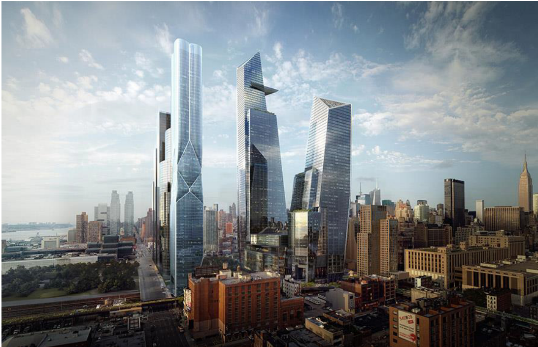
Figure 1. A rendering of Hudson Yards in Manhattan.

we can perceive it in reality, namely through certain colours, reflections, shadows, etc. As one visual artist said in an interview: