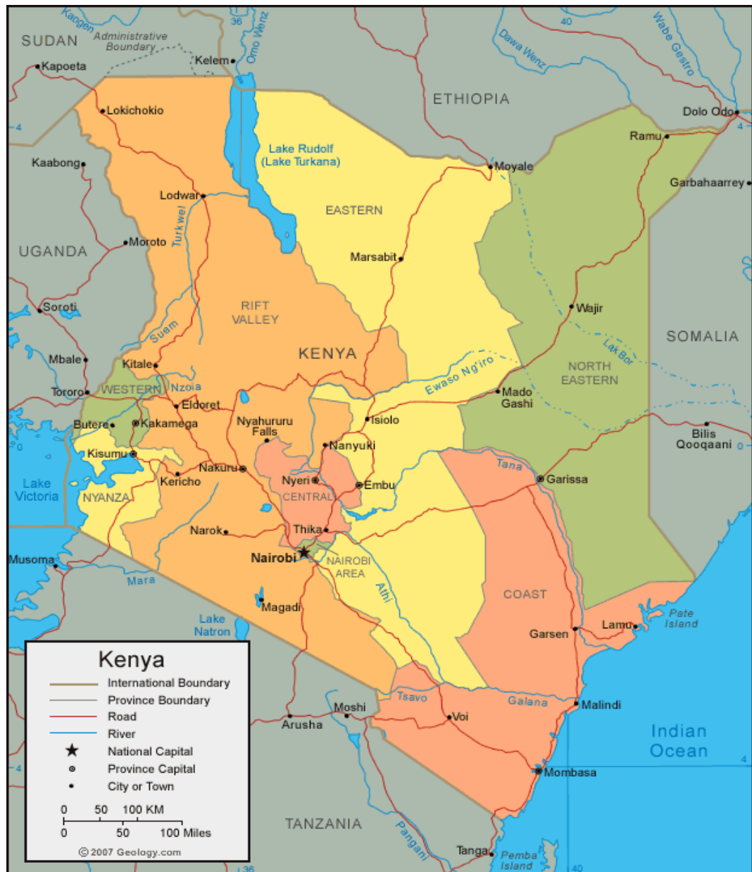
Figure 1: Kenya's eight provinces, their headquarters and some major towns